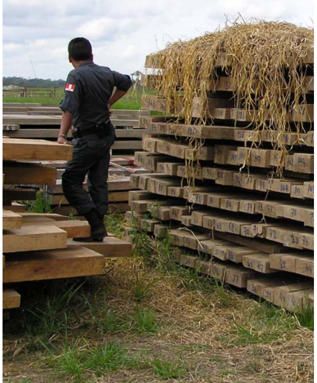
6. Unhindered access to information: Access to all relevant documents held by forest, tax, and other relevant authorities is essential. The

Why? Especially where monitoring is expected to be carried out by local civil society groups (albeit with international support initially), there is a high risk that political interference or lack of commitment to funding will result in the monitor(s) being rendered ineffective.