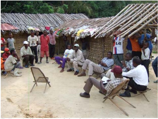
Full and effective participation: a REDD+ requirement

Crucially, by engaging civil society on IM-REDD and integrating it in the overall system for monitoring REDD+, dialogue among often polarised stakeholders will improve, as will trust and confidence.