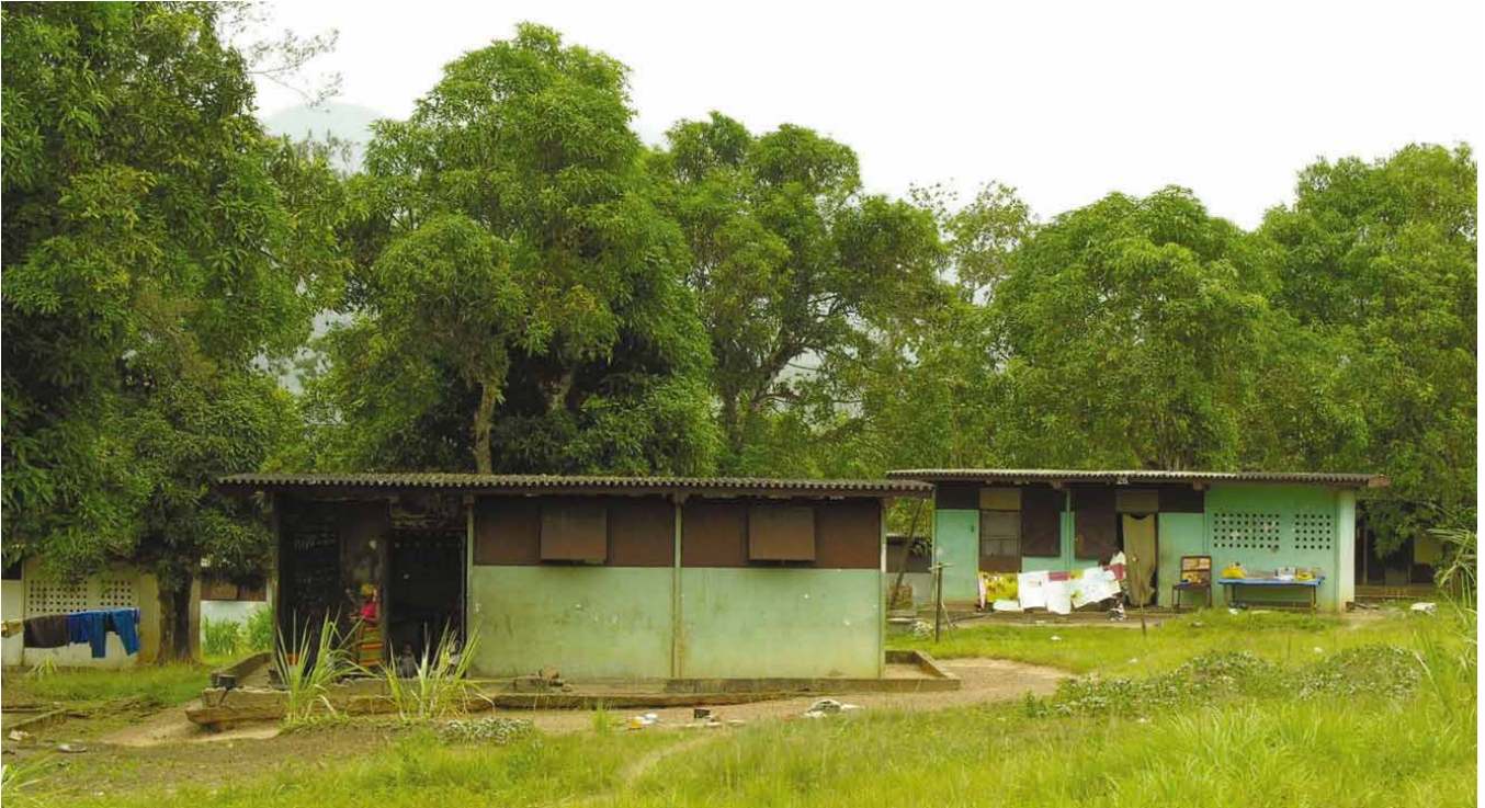
Former LAMCO mine worker's house in Yekepa