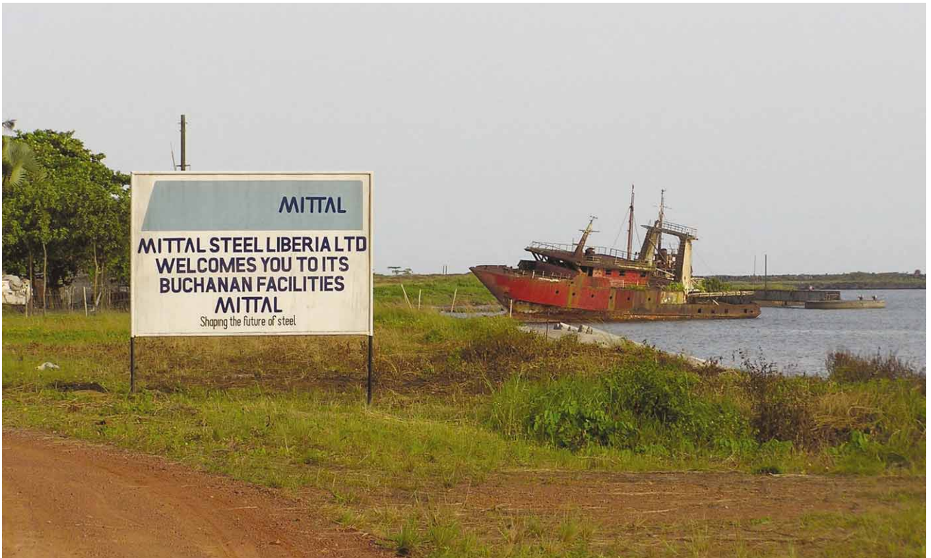
Mittal Steel Liberia Limited sign, Buchanan Port