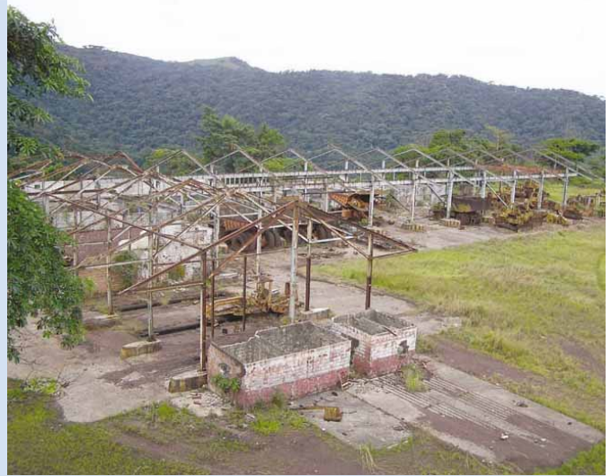
War victim: derelict Lamco building, Yekepa