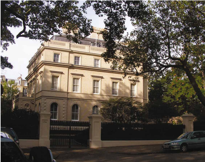
Lakshmi Mittal's house in London