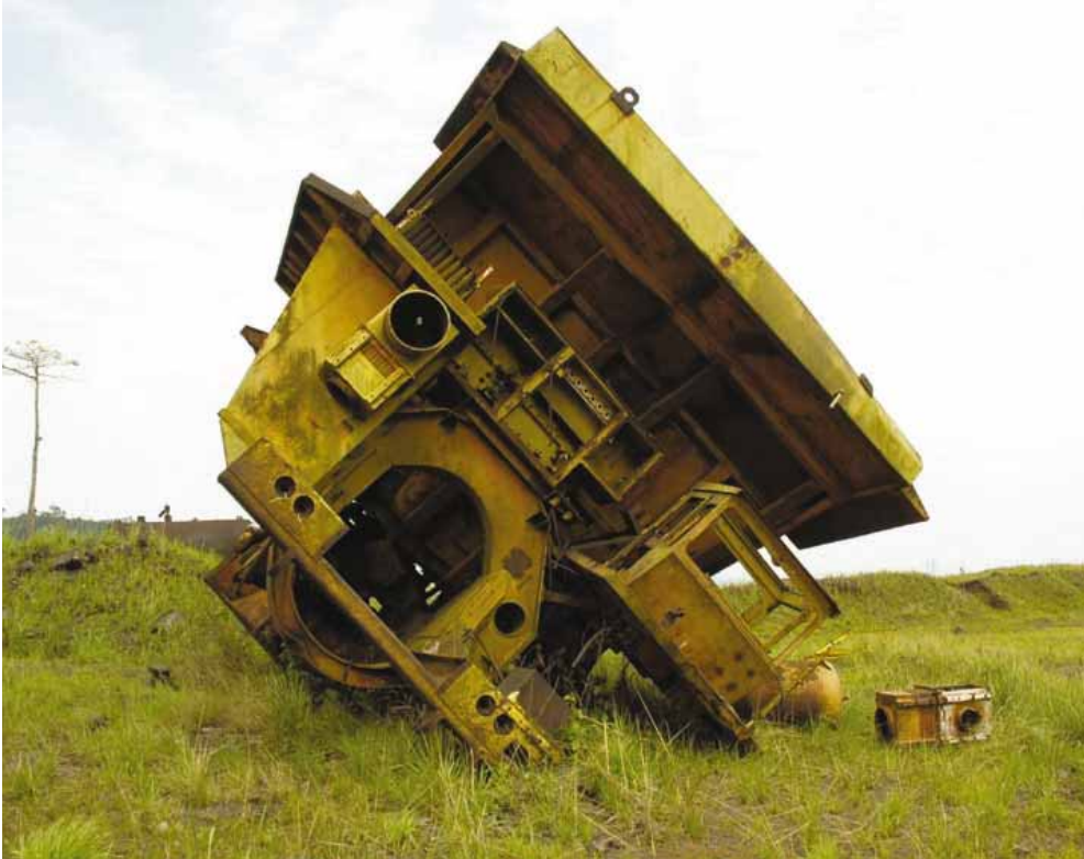
Derelict Lamco Machine