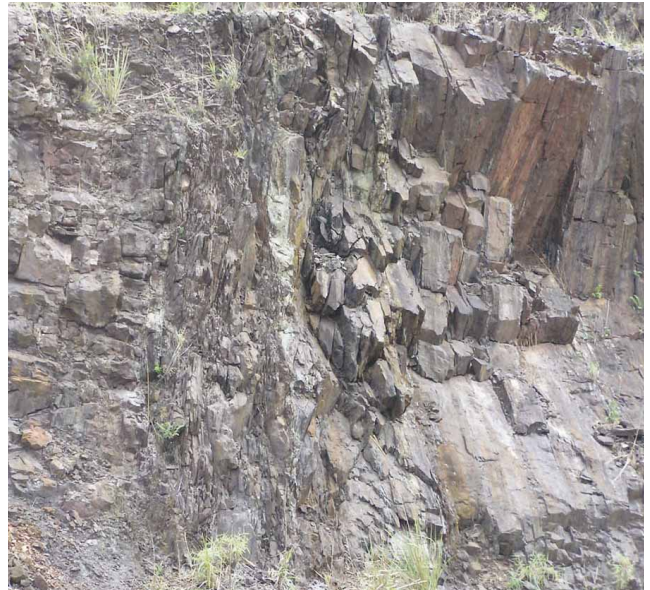
Valuable asset: iron ore, Yekepa,

Section 2: In the event that the CONCESSIONAIRE would build facilities to process iron Ore into higher added value products including but not limited to pellets, DRI and HBI, a lower rate of royalty shall be negotiated between the Parties prior to the commencement to the development of the necessary production facilities.”