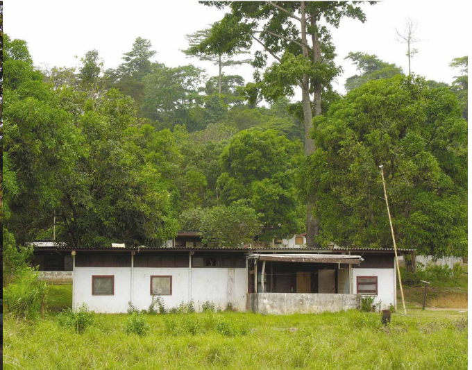
Former Lamco house in Yekepa