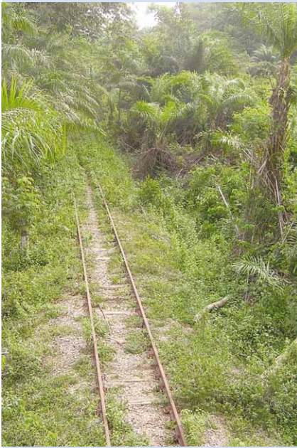
Derelict railtrack between Yekepa and Buchanan Global Witness May 2006

The control over the Yekepa railway and Buchanan port could bring potential revenue to either the GOL or Mittal, depending on who runs these infrastructures, for example by providing use of these facilities to companies involved