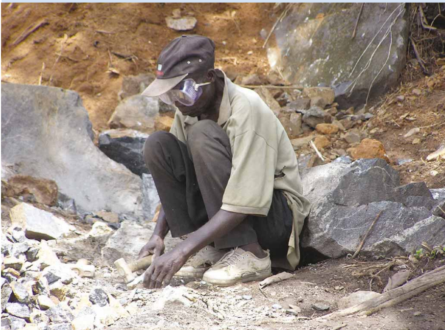
Hard labour: subcontracted workers crushing rocks for Mittal's railway, Buchanan

In March 2006, Global Witness interviewed eight people from Nekren township, near Buchanan, who said that they were breaking rocks to rebuild the railway for Mittal Steel. They reported that they were sub-contracted by truck drivers, who had been contracted by Mittal. They were paid US$49 for a small truck load. It takes five people about five days to fill one truck, and the remuneration worked out at just under US$2 per person per day. There was insufficient safety equipment for all of those engaged in the work. Although the provision of jobs will have a positive impact on Liberia, it is important that adequate salaries and safety equipment are provided for Mittal employees and those it contracts. Responsibility to provide adequate working conditions and pay cannot be contracted out.