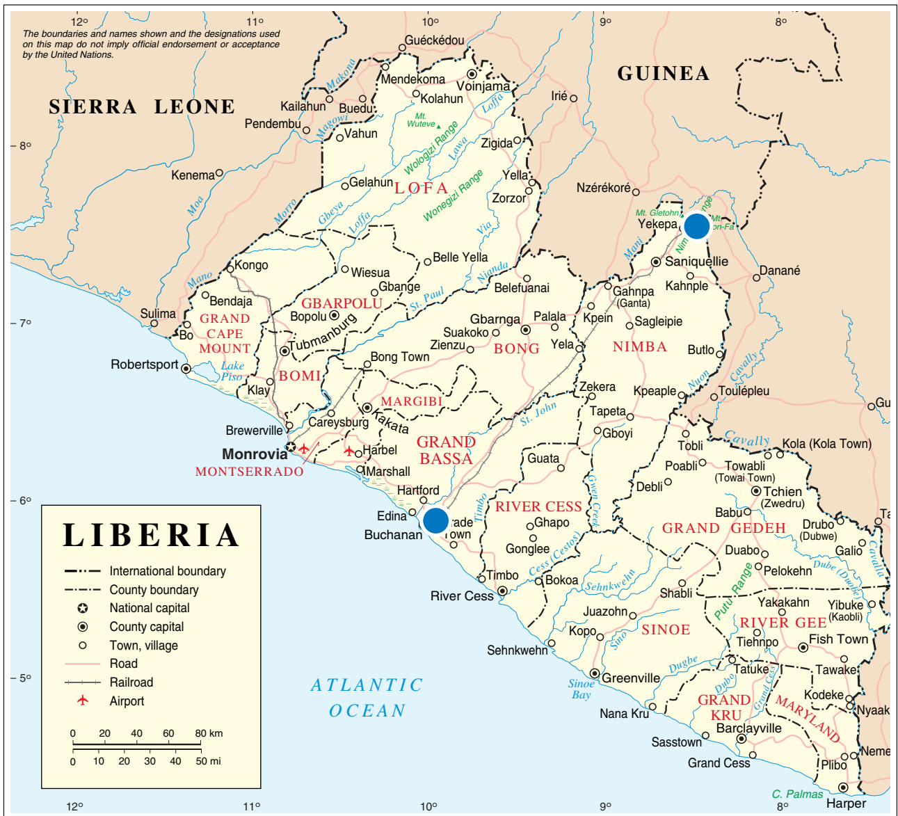
Map No. 3775 Rev. 6 UNITED NATIONS January 2004

Department of Peacekeeping Operations Cartographic Section