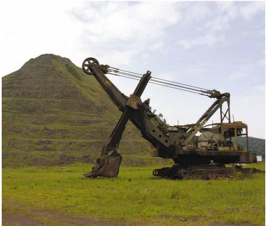
Derelict machine left by the former Concessionaire LAMCO (the Liberian American Swedish Minerals Company), Yekepa,

The contract commits the government to stringent provisions of confidentiality and non-disclosure of information. Transparency of revenue flows and contracts are a critical first step towards the responsible management