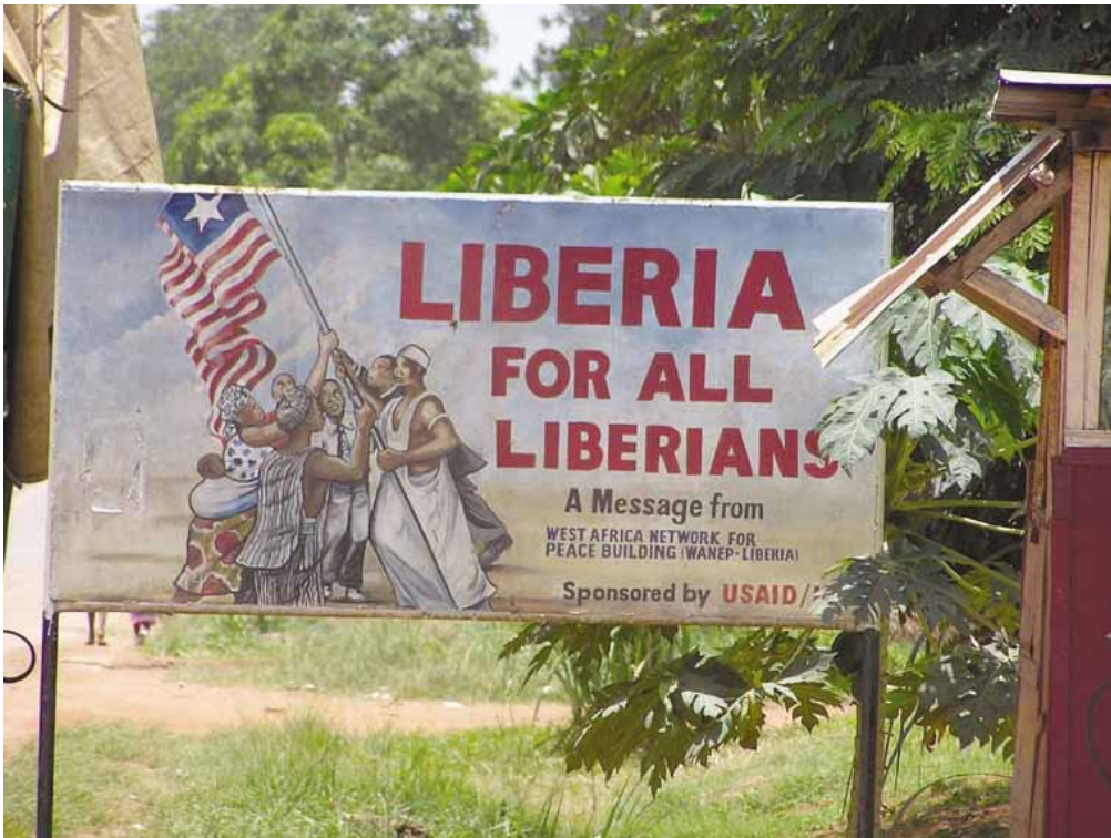
Liberia for all Liberians?