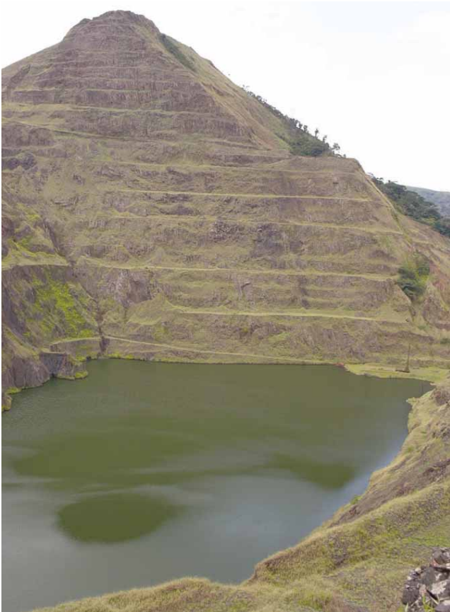
Mine tailing, Yekepa