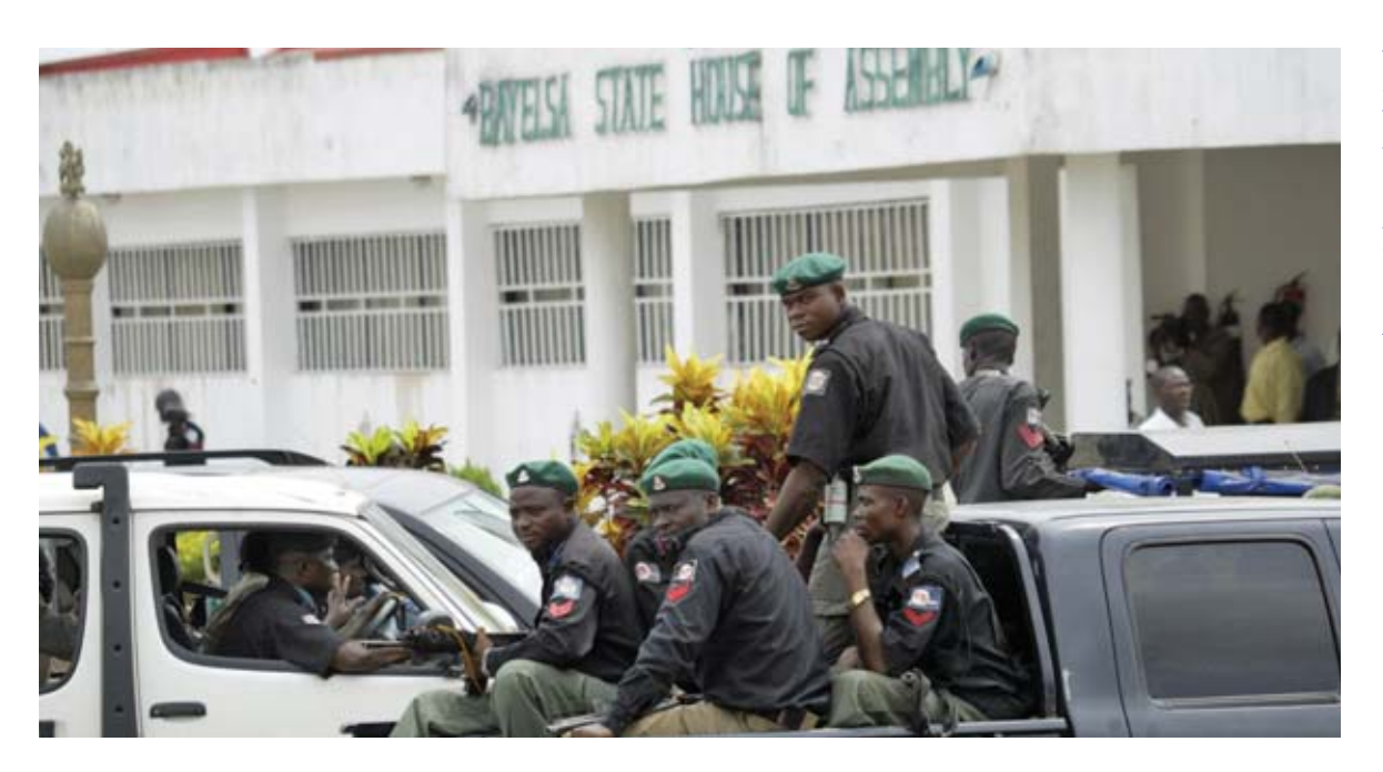
Security forces guard the Bavelsa State Assembly as its members debate the impeachment of Alamieyeseigha for corruption, in November 2005.

the very least are doing no harm to, the government's commitment to tackling corruption and to promoting development.