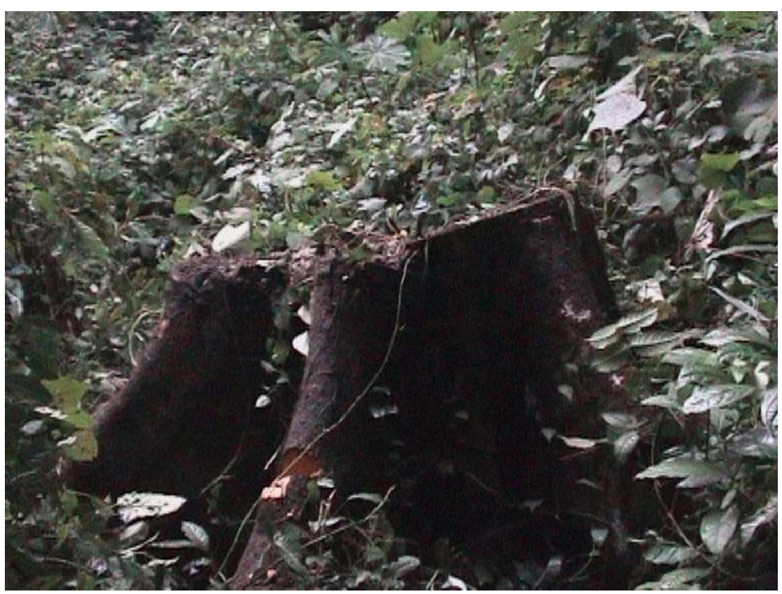
A Pycnanthus angolensis outside the AB boundary of ARB 027