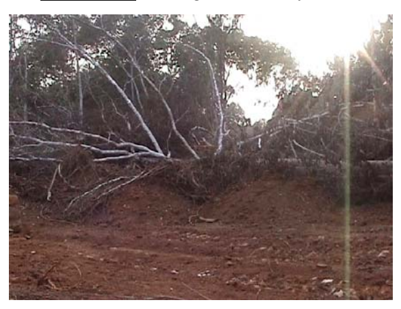
Photos 3, 4 : Passage voluntarily obstructed and pieces of timber without any stamp

The mission also observed that there were pieces of timber abandoned on the yards; there were also pieces of timber and stumps without any stamp (see picture 3), and Iroko abutments with a diameter that was less than the minimum authorized for exploitation.