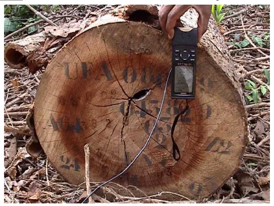
Photo 5 : Piece of timber found out of the limits of the Standing Volume No.04