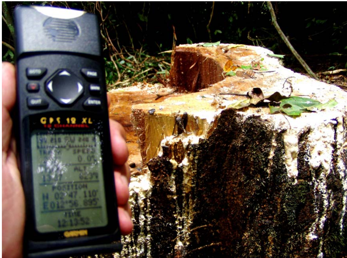
Photo: Stump of a felled iroko measuring under the minimum exploitable diameter permitted