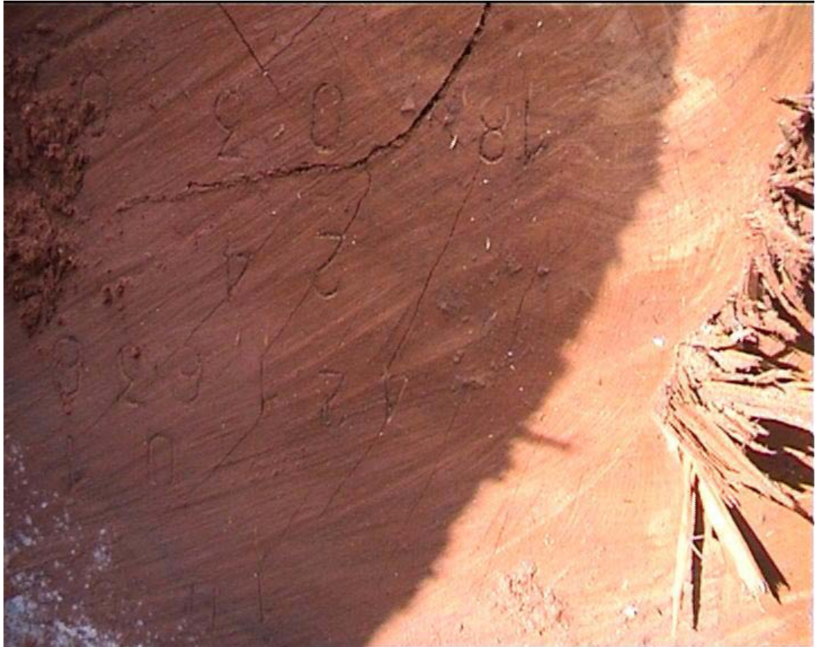
Photo 6: Felled log whose diameter is below the minimum diameter considered acceptable for exploitation.

Some log ponds discovered in ASV No.42 of FMU 10 046 contained logs below the minimum diameter permitted for exploitation. This was the case of log bearing DF10 number 421636, shown in the following photograph.