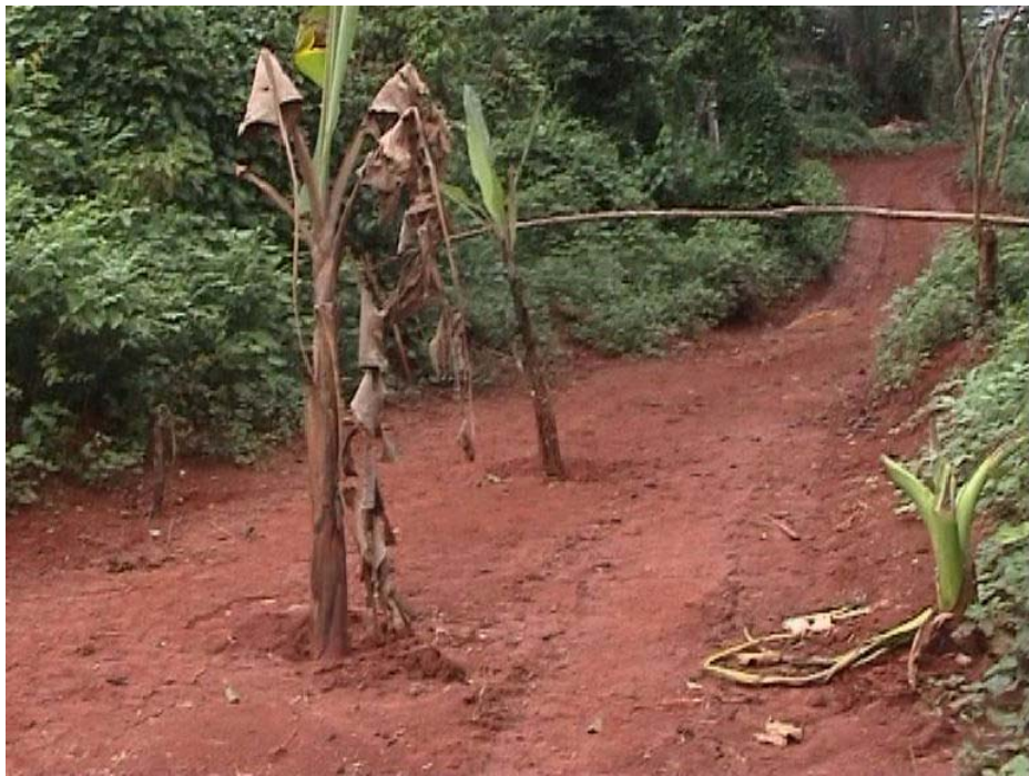
Photo: Main access road to the Grumex work site