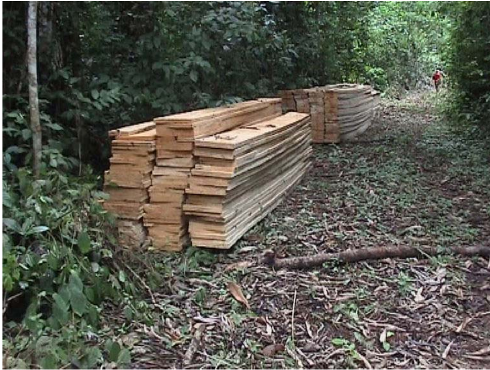
Photo 4: Product of traditional sawing in the periphery of the forest reserve