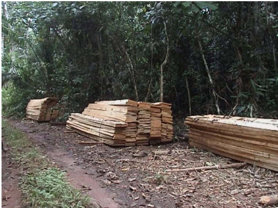
Photo 3: Stock of planks in the periphery of the Dend-Deng reserve

The significant quantities of planks found in certain places convinced the Independent Observer of the extent of small-scale sawing activity in areas very close to the reserve. (see photos below.)