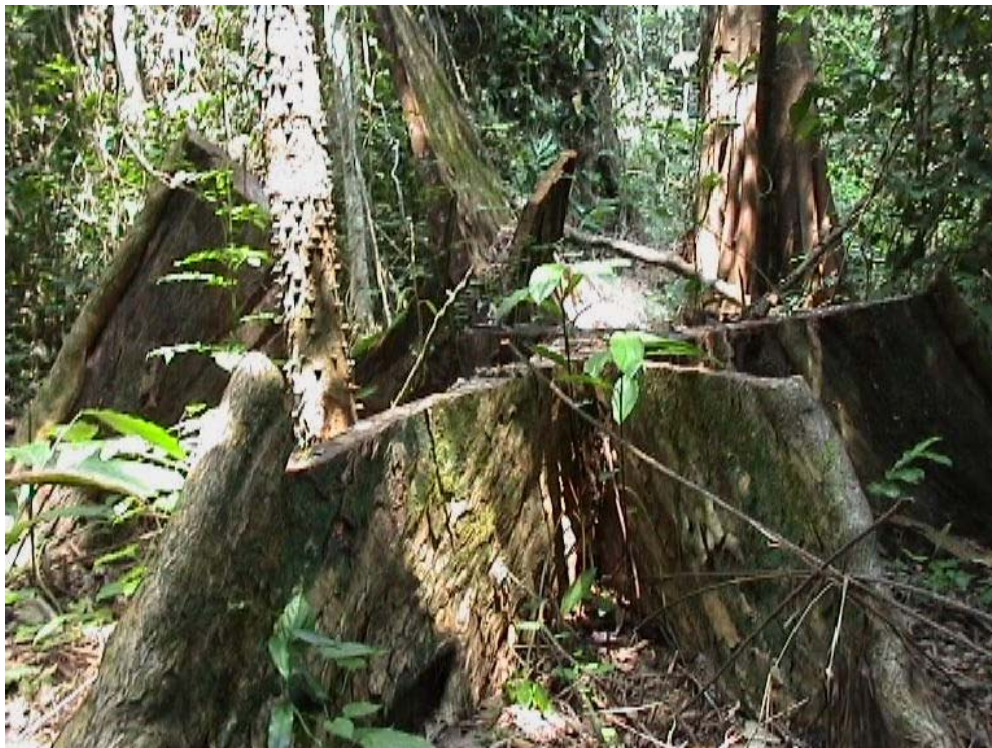
Photo 2: Stump of a tree felled in the Dzandouang zone and bearing no markings.