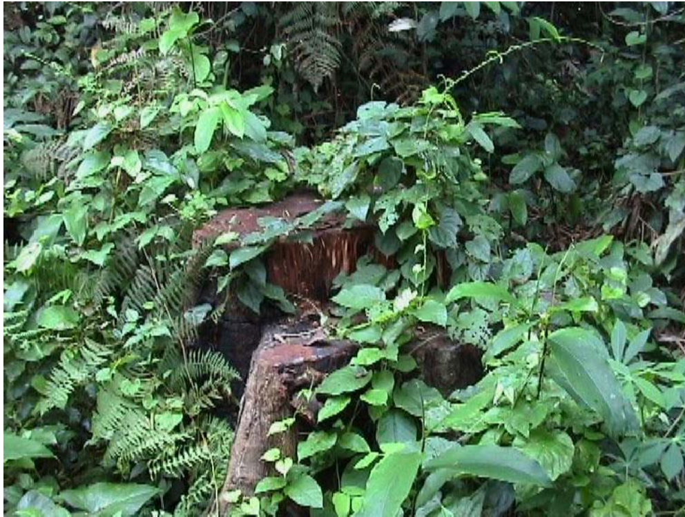
Photo 1: Stump of a tree felled in the Dzandouang zone and bearing no markings.