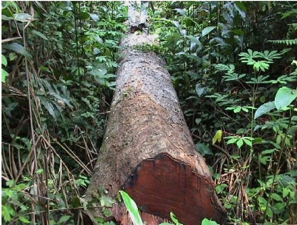
Photo 3: Tree felled in the Dzandouang zone and bearing no markings.

Photo 3 shows that there has also been wood abandoned in the Ndzandouang forest: