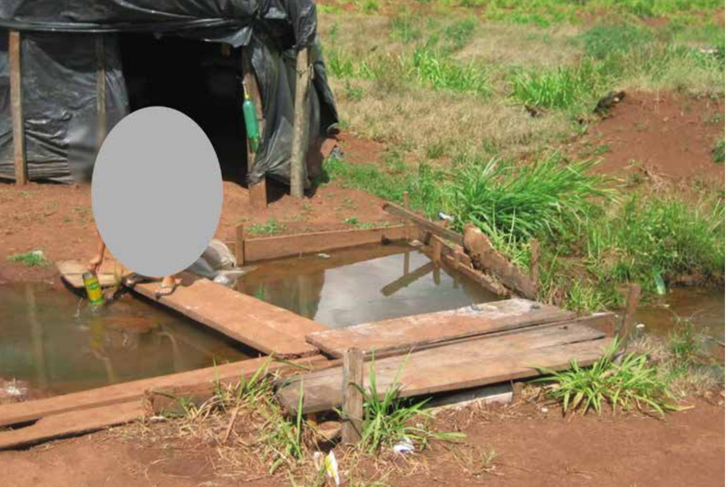
Image of some of the conditions of labourers in Fazenda Terra Roxa. From FOI requests to Brazil's Ministry of Work

investigation now reveals a recurring pattern of human rights abuses and use of slave labour carried out on their properties over many years.