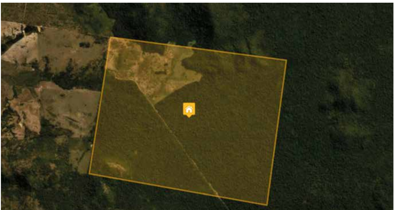
Image of Fazenda Boca do Monte from Brazil’s Environmental Rural Registry (Cadastro Ambiental Rural - CAR).

Under guidance endorsed by Federal prosecutors in Pará and agreed to by JBS, 79 slaughterhouses are legally prohibited from purchasing cattle from ranches where the annual production exceeds an average of three cows per hectare. It stipulates this is currently the upper limit of animals that can feasibly be fattened on a plot of Amazon land, even with the best feed, soil and grass quality. 80 Production rates higher than that are a certain indicator of cattle being raised elsewhere. Yet Global Witness found that in 2020, Boca do Monte sent 1298 cows to JBS’s slaughterhouses in Pará 81 from just 120 hectares of pasture - an average of almost 11 cows per hectare. For 2021, it received 828 cattle from the same ranch, an average of almost 7 cows per hectare and more than double the permitted amount. 82 In addition, no cattle confinement infrastructure – identifiable by fences and rooves and used by farmers with high productivity rates to weigh cows and to provide them with extra feed - is visible in satellite imagery of the ranch. 83 The guidance stipulates beef companies should check whether such infrastructure exists when buying from a ranch producing more than three cows per