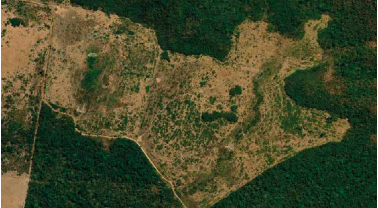
Satellite imagery of Fazenda Boca do Monte.

hectare. 84 Therefore JBS should not have purchased from the ranch according to its legal agreements.