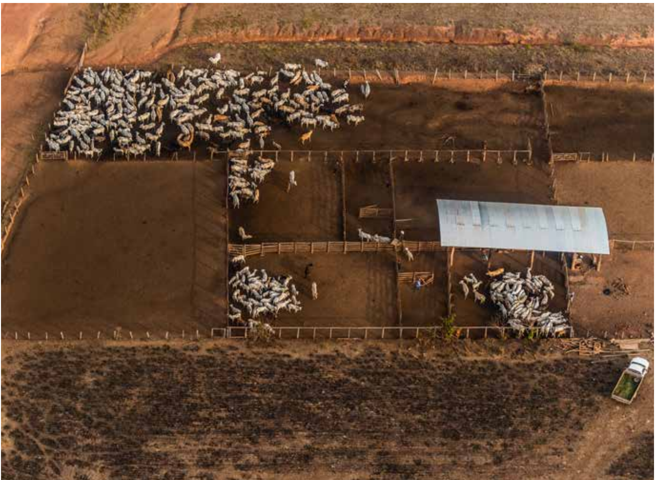
Aerial images of cattle fields in São Félix do Xingu, Pará State, Brazil, 2019.

JBS's contribution to Amazon deforestation is well established. In 2020, our report Beef, Banks and the Brazilian Amazon revealed that between 2017 and 2019, JBS bought cattle from 327 ranches in Pará containing over 20,000 football fields-worth of illegal deforestation. This was contrary to its no deforestation legal agreements