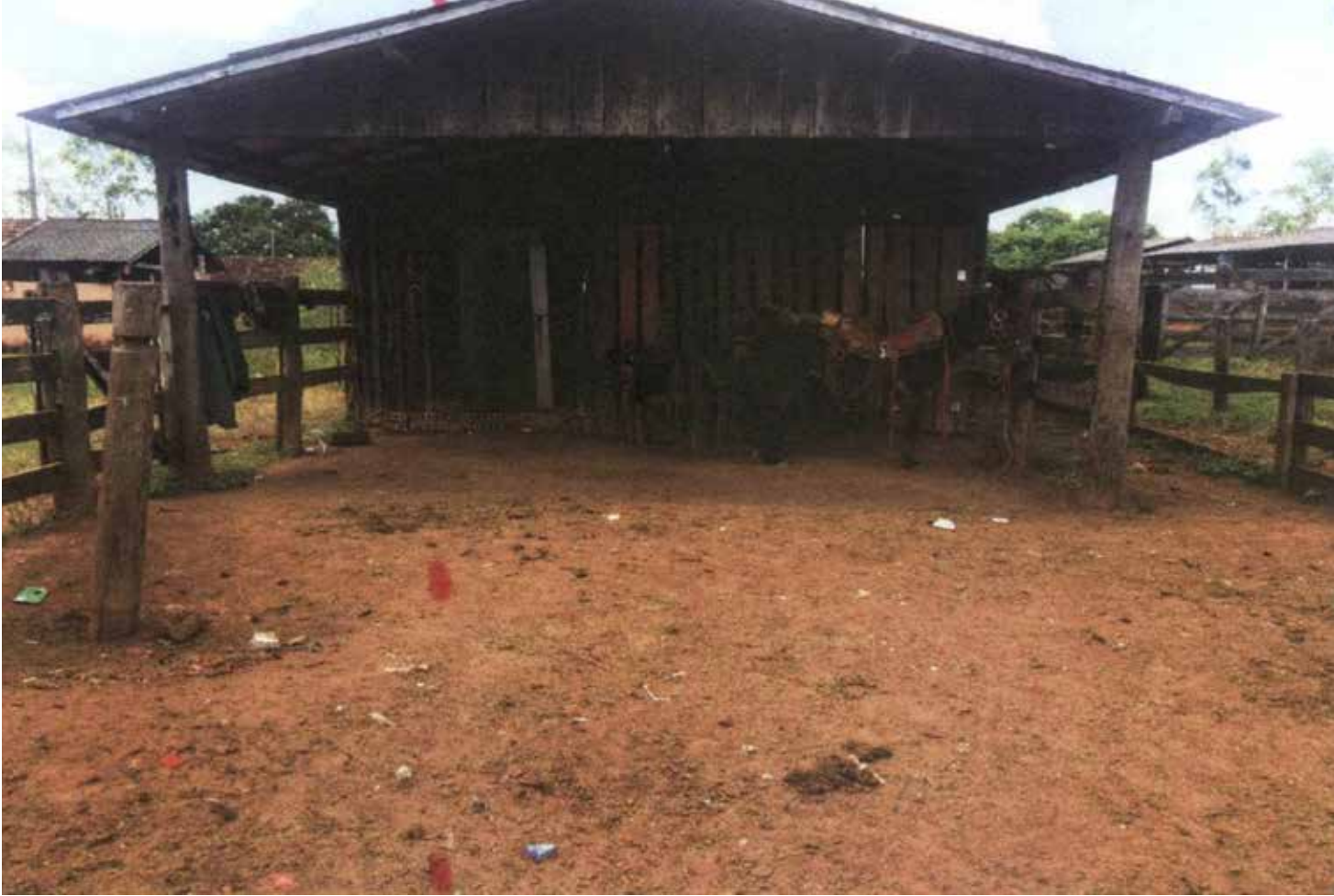
Image of the barn where one of the workers allegedly slept with farm animals, taken by Ministry of Work inspectors.

“Life has been difficult... it’s so surreal.” 45