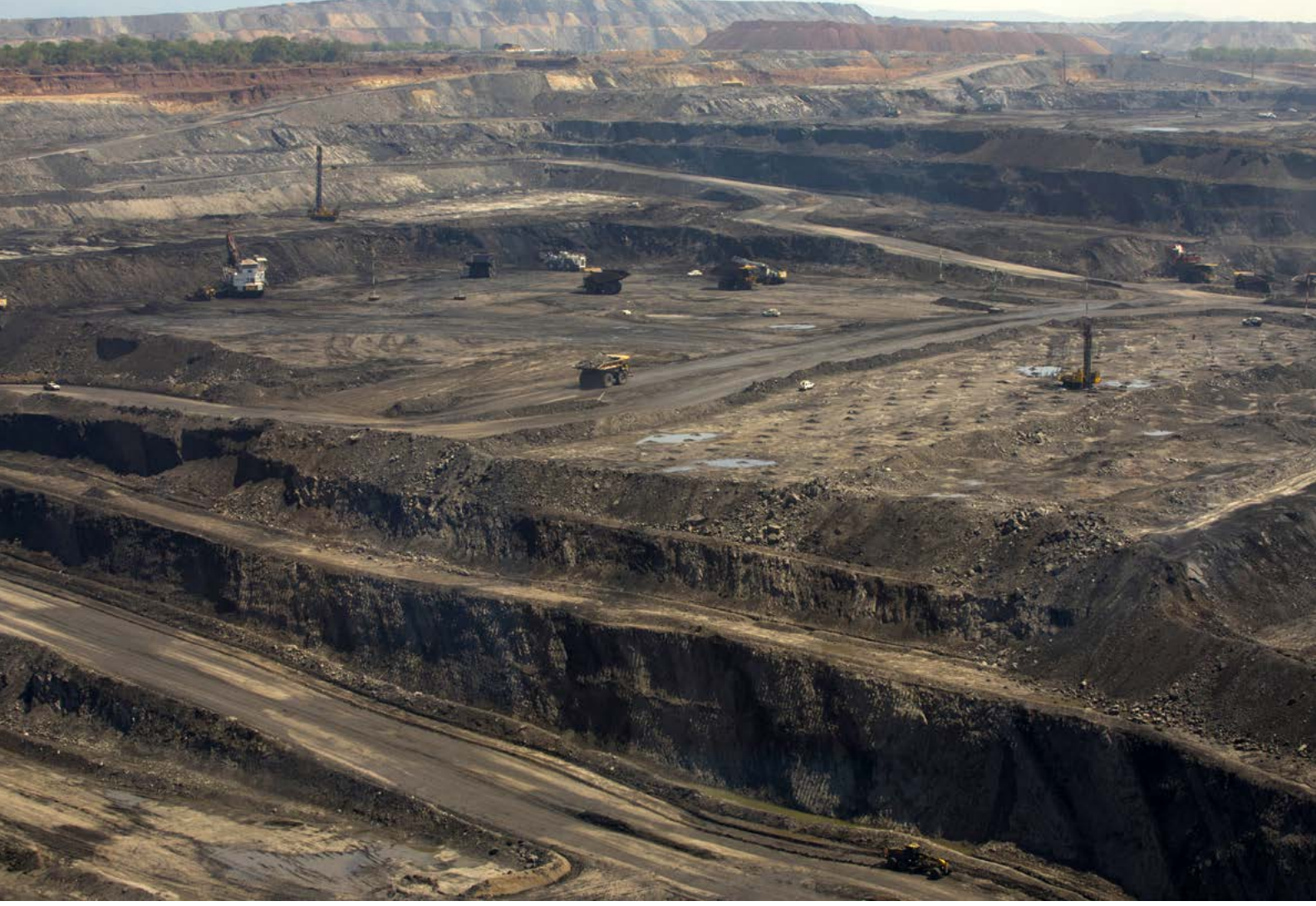
Machinery operating in the annex pit at the Cerrejon Coal Mine in Barrancas, La Guajira, Colombia.