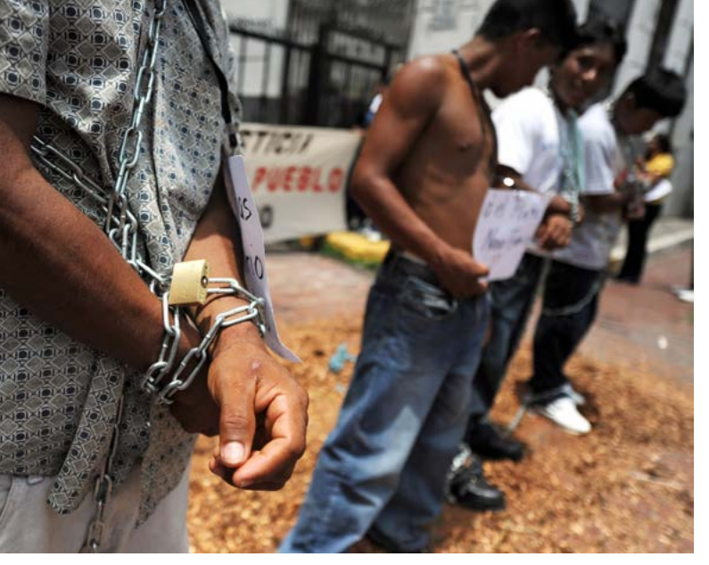
Indigenous Naso campaigners stand chained to each other during a protest outside the Presidential Palace in Panama City in 2009. The Naso have been calling for formal land rights recognition for decades.

doubt – including the Keystone XL pipeline. However, indigenous communities and climate campaigners have continued to face criminalisation and police violence for their protests against the Enbridge 3 pipeline.<sup>35</sup>