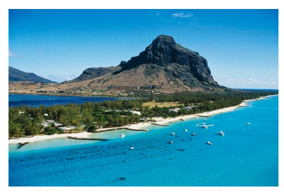
Mauritius, the Indian Ocean island where Adaro Energy has two subsidiaries in its offshore network

accounts and not all of Arindo Holdings' accounts are available online (companies are not required to publish any or all of their accounts in Mauritius). Neither company appears to have paid tax in Mauritius until at least September 2017, after which Arindo changed the status it held under local corporate law, in order to raise capital and become listed on the stock exchange of Mauritius, and it appears will now be subject to a maximum tax rate of 3 per cent.<sup>22</sup>