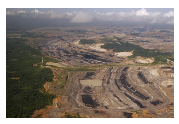
An aerial view of Adaro's Tutupan coal mine in Indonesia's South Kalimantan province

At the same time as expanding its offshore network, Adaro stands to benefit from Indonesian government financial guarantees for the US$4 billion Batang coal-fired power plant, which will be the biggest in Indonesia, in which Adaro is a joint venture partner. Adaro expects the power plant to create up to US$80 million a month in revenues for the joint venture, of which Adaro itself owns 34 per cent, once it is up and running. This means that, in effect, Adaro is relying on the government (and therefore Indonesian citizens) to provide a guarantee for one of its sources of future profit while, at the same time, making use of offshore companies which may reduce its potential tax payments in Indonesia.