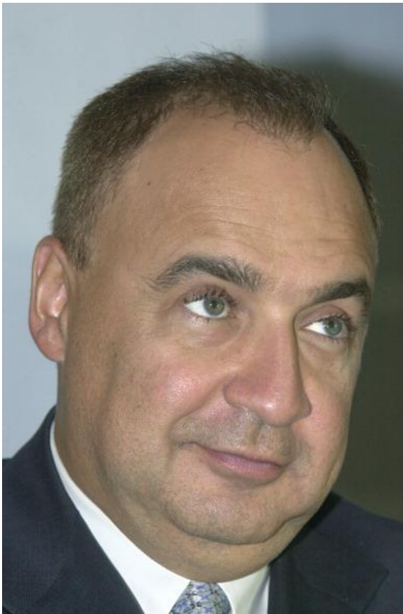
Oligarch Leonard Blavatnik controls Access and has problematic Russian business partners.

These Russian ties appear to have piqued the interest of Special Counsel Robert Mueller’s Russia investigation. As an American citizen, Blavatnik can donate to American politicians, and over the years he has contributed to Republicans and Democrats alike. 16 However, in December 2016 Access shot to