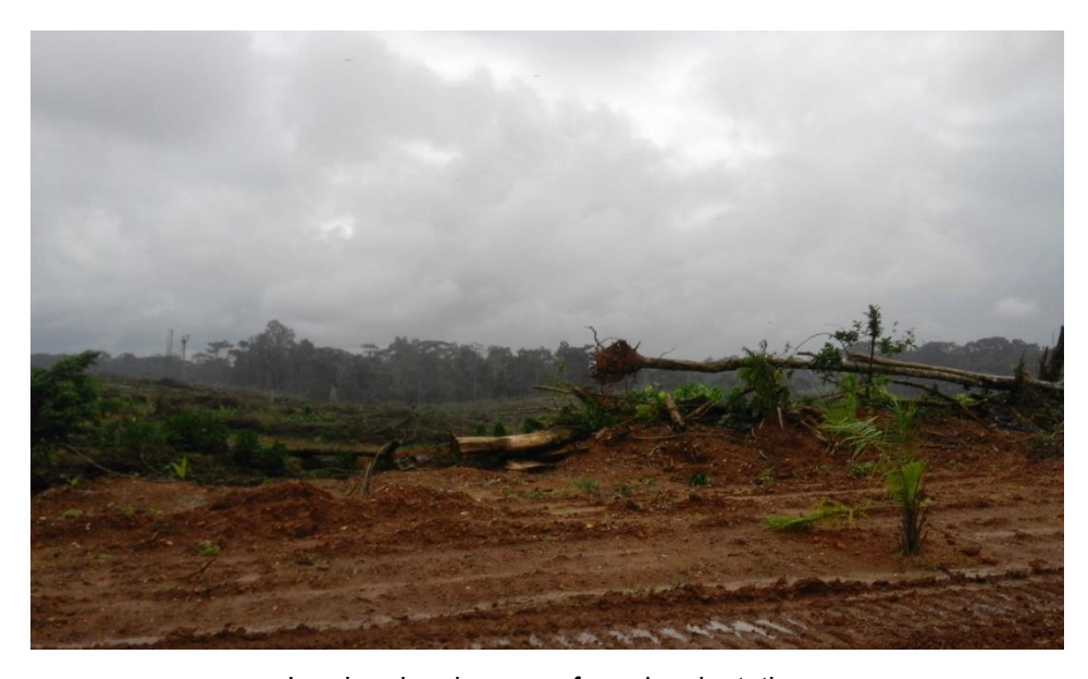
Land under clearance for palm plantation