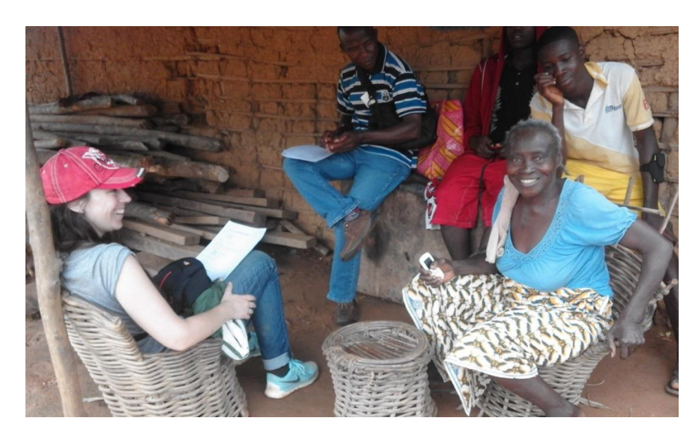
Interview with elderly woman in Butaw