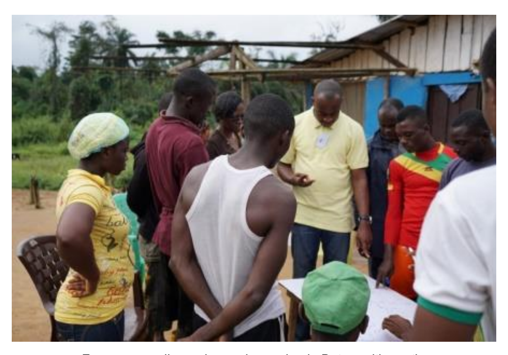
Focus group discussion and mapping in Butaw with youth.