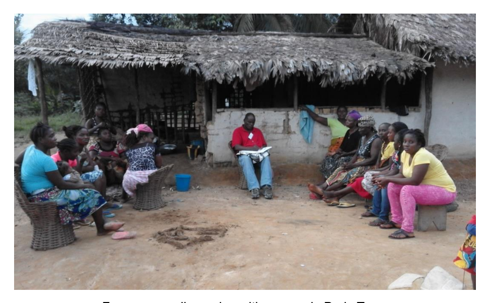
Focus group discussion with women in Paris Town