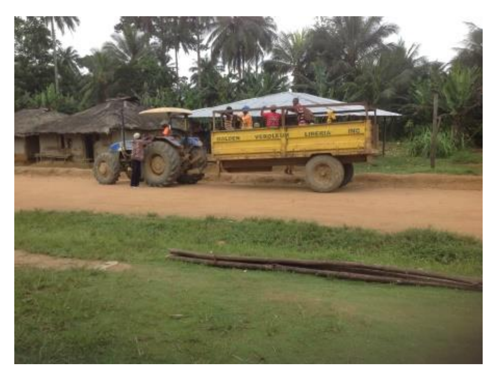
Means of transport for GVL workers