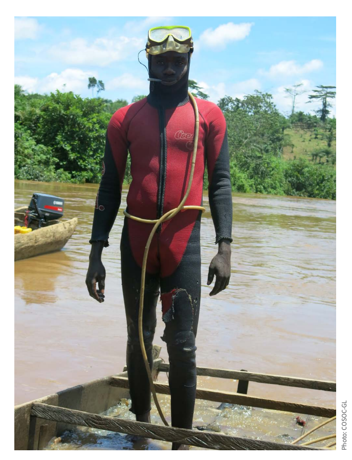
A gold diver on the Ulindi River.

men agreed to share equally "all taxes due from every workplace where we use dredging machines".