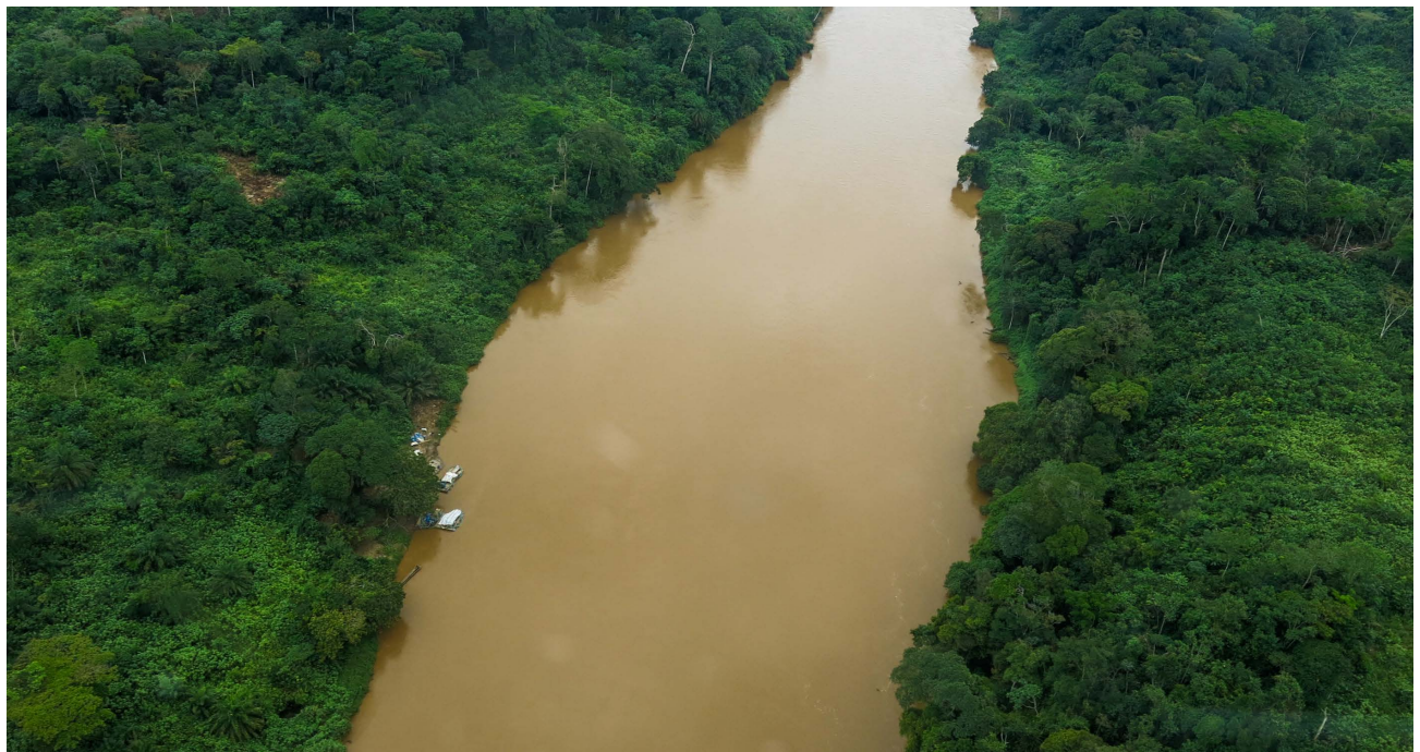
Aerial view of the Ulindi River: several dredgers are moored along the left-hand bank.

At these volumes, Kun Hou's Ulindi gold should have generated hundreds of thousands of dollars