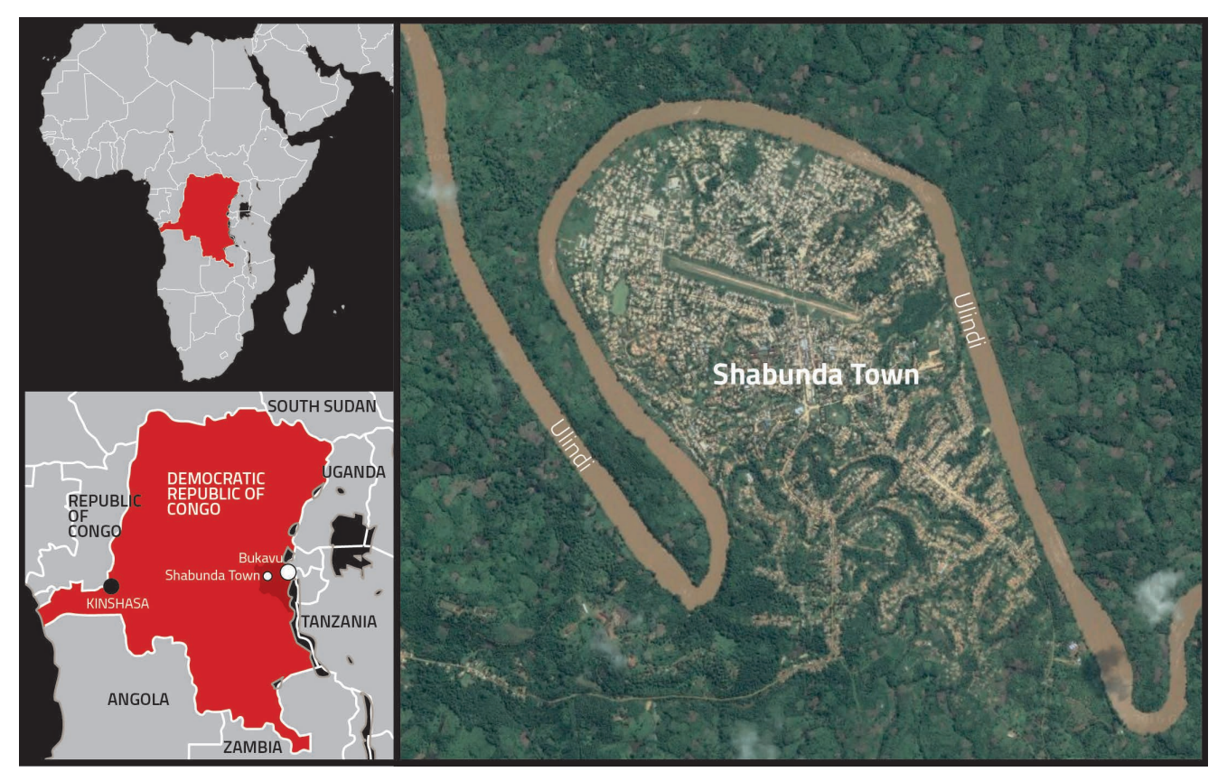
Shabunda town, the eponymous hub of Shabunda territory, cannot be accessed by vehicle. Considered an "enclave", the town has no running water or electricity: generators provide current for the few who can afford it.

chain due diligence, and must effectively monitor its implementation. <sup>11</sup> Companies that fail to meet international supply chain due diligence standards laid out by the OECD must be held to account.