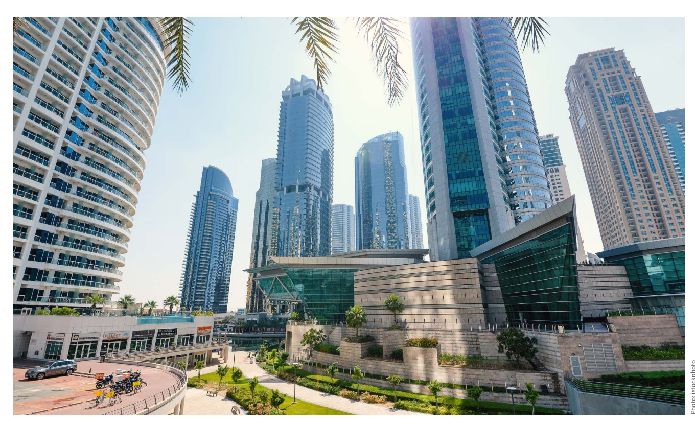
JLT Free Zone Dubai, home of the DMCC and Alfa Gold Corp DMCC Dubai.

An employee at Cavichi, the other of Bukavu's trading houses known to have bought gold from Shabunda and exported it to Dubai in 2014, told Global Witness in a 2015 interview that his company had no responsibility for "knowing where the gold is from – that's the role of the Congolese state". 104 This shows total disregard or ignorance of the law.