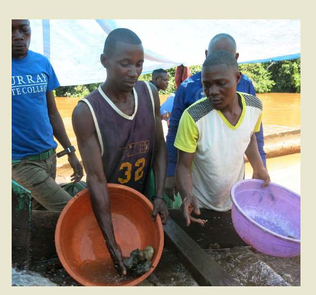
Artisanal gold miners, Ulindi River, Shabunda.

"This is the gold they extract out there [on the river Ulindi]. [Shows gold] here is six grams. It's like sand. That's one day's work. That's my salary. That's 20% [of what I got from the river], the six grams. I took one day [to get that] – 10 hours. I made 30 grams in production [in total]. So they gave me six.