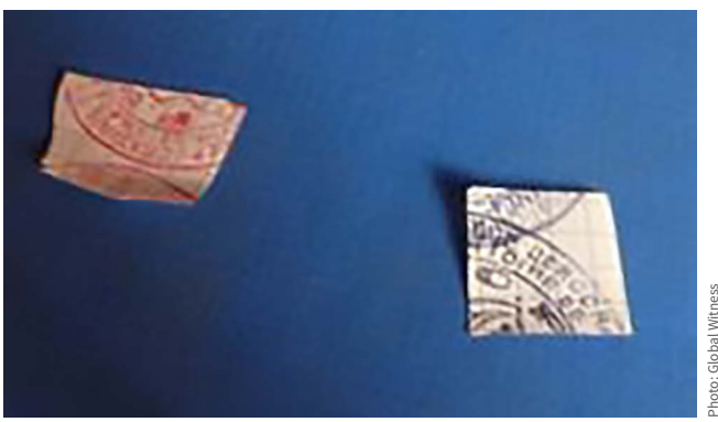
Paper receipts issued by armed men to gold dredge workers for "tax" payments.

Views of the threat posed by these armed groups vary. Some local people told Global Witness that the Ulindi's armed men were largely "youths without a real aim" who had been driven to fighting in the forest