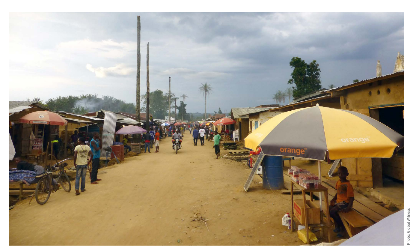
Shabunda town, South Kivu.