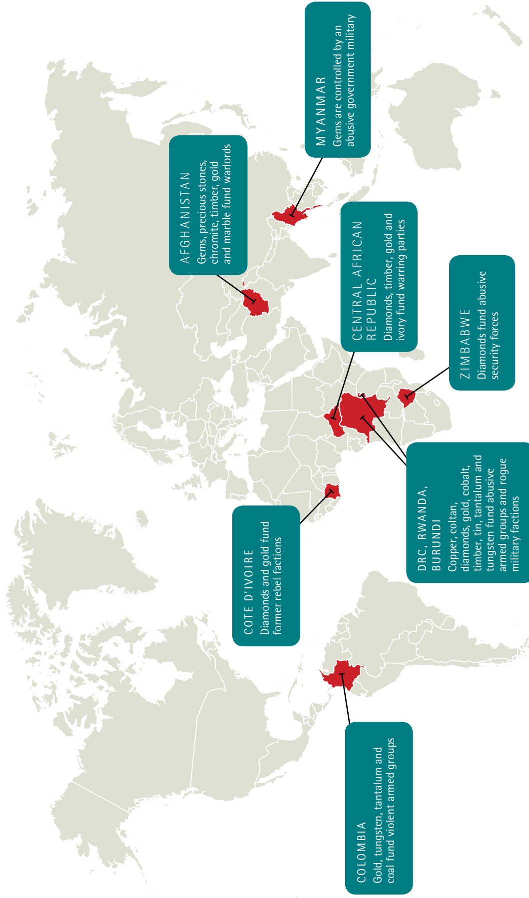
This map highlights examples of countries and regions where natural resource supply chains fuel conflict; it is not an exhaustive list.