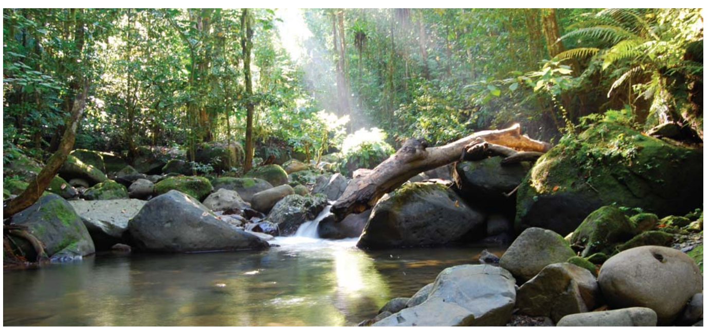
In order to deliver on its potential, REDD must prioritise the protection of primary forests. Papua New Guinea, 2007