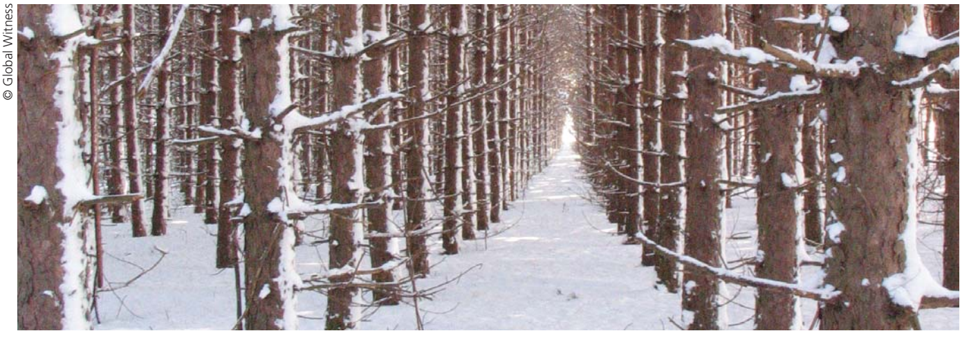
The Northern model of sustained yield forestry is based on conversion of primary forests to managed stands. Ontario, Canada 2004

SFM has also proven to be difficult if not impossible to regulate due to inadequate forest law enforcement and poor governance. Most countries which stand to benefit from REDD suffer to varying degrees from: poor legal frameworks, poor enforcement of even good legal frameworks, illegal logging (both by legitimate and illicit actors), non-compliance with relevant laws and guidelines, corruption and patronage between political and business elites and the logging industry, and weak institutions.