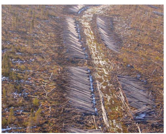
FSC in action. Boreal clearcuts as large as 10,000 hectares (almost twice the size of Manhattan) have proven to be consistent with SFM certification standards.

At the forest management unit level, various forest certification systems have attempted to define standards for SFM, but a large discrepancy exists between different certification standards,<sup>10</sup> and many have been created by industry associations in order to rubber-stamp business-as-usual operations.<sup>11</sup> Forest certification was not designed as a mechanism to lower carbon emissions, and no certification system prohibits the logging of primary forests, the biggest reservoir of terrestrial carbon. Ultimately certification is voluntary and thus unable to assure the permanence of improvements made or carbon stored.