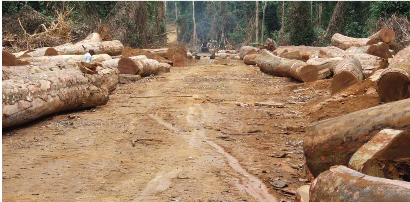
Industrial logging in the tropics, under the guise of SFM, has failed to deliver development benefits. Province Orientale, Democratic Republic of the Congo, 2007

Concession-based industrial logging puts the majority of accessible forests into the hands of a few large companies. In least developed nations, such as Papua New Guinea and the countries of the Congo Basin, the forest sector is often controlled by foreign companies. Around 80% of the logging in Papua New Guinea is carried out by Malaysian companies;<sup>25</sup> in Cameroon, 80% of timber production is controlled by less than 20 (mostly European) companies.<sup>26</sup> The DRC recently approved the allocation of roughly 97,000 km<sup>2</sup> of mostly intact forest to a group of logging companies, almost all of them foreign. An area the size of Switzerland, for example, was allocated to just two European logging companies.<sup>27</sup>