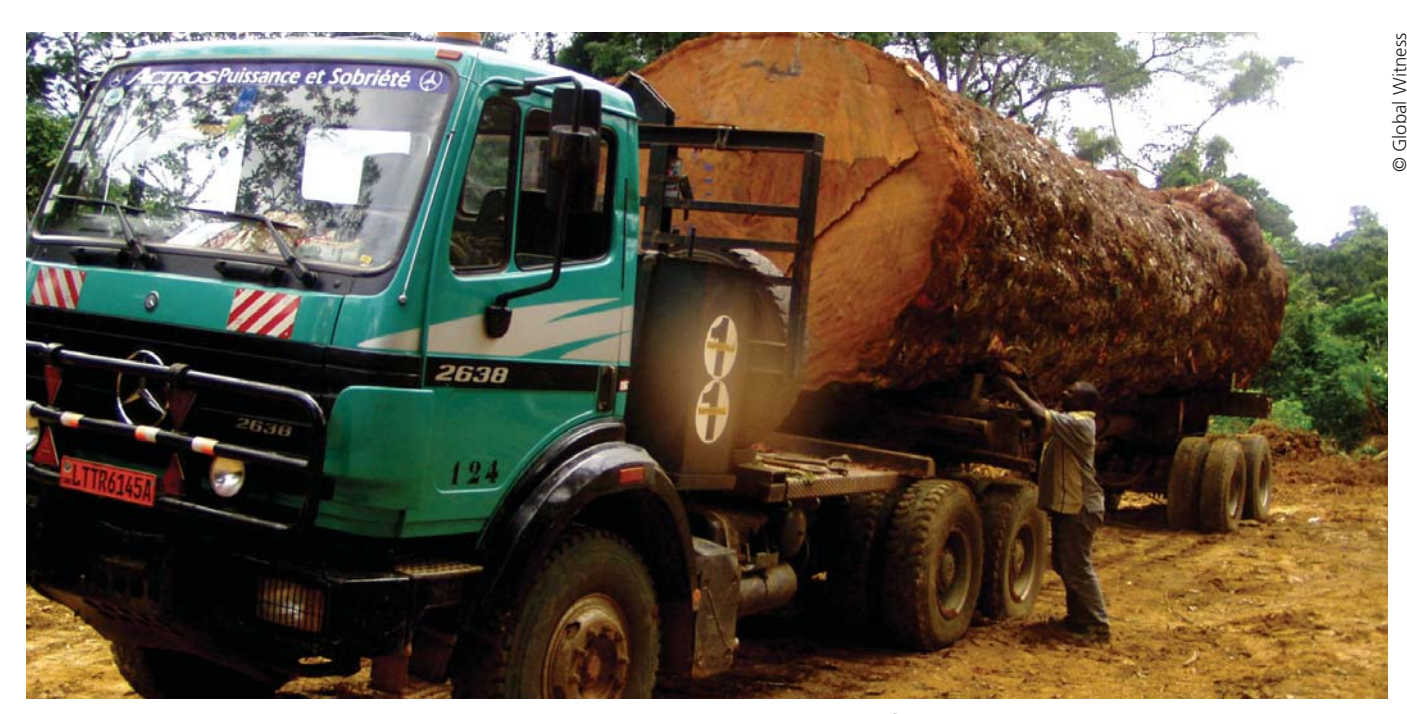
Given the time it takes a tree this size to grow back, and the likelihood that it ever will, primary forest "management" in the tropics is more aptly described as timber mining. Southern Province, Cameroon, 2004

A number of regional processes have attempted to define SFM in terms of criteria and indicators, and these are considered by the international forest policy makers as the main framework for assessing SFM at the country level.<sup>6</sup> However, these criteria and indicators only list parameters that are to be measured and do not set any performance standards .<sup>7</sup> For example, they may require countries to report on the "rate of conversion of forest cover to other uses" ,<sup>8</sup> but make no judgment