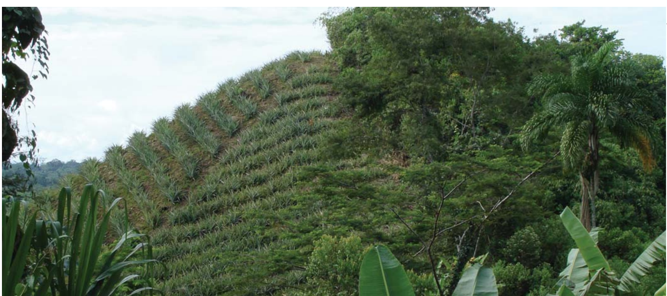
REDD is at risk of allowing natural forests like the one on the right to be replaced with intensively managed plantations, releasing massive amounts of carbon in the process. Peru, 2006.

The vast forest resources and international donor support allotted to industrial logging operations translate into a relatively small number of jobs, most of which are unskilled and low-wage, and yield modest government tax revenues. A recent review found that tax revenues from timber for the five largest countries of the Congo Basin were less than $130 million combined.<sup>28</sup> The Republic of Congo receives around $20 million in tax revenues<sup>29</sup> from the forest sector, compared with roughly $3 billion in oil revenues (in 2007).<sup>30</sup> Even in countries with a well-developed logging industry, formal employment typically accounts for less than 0.5% of the total workforce, according to the FAO.<sup>31</sup> In Cameroon, formal employment in the forest sector is around 15,000, while agriculture provides the livelihoods for around 2 million people.<sup>32</sup> Overall, formal forest sector employment opportunities are tiny compared with the number of forest-dependent people whose livelihoods are negatively impacted, often permanently, as logging operations deplete the resources and degrade the ecological services provided by natural forests.