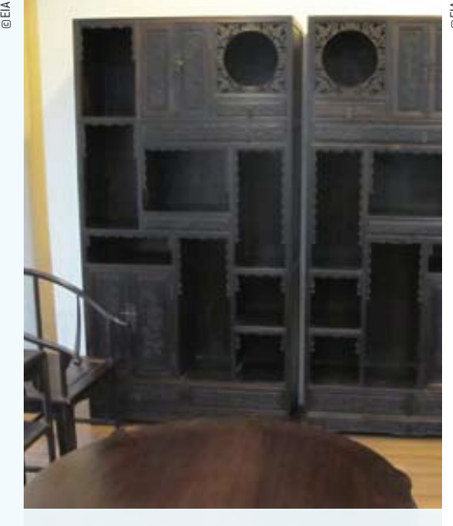
Image 7: The rosewood cabinet above retails for approximately USD60,000. Shanghai.

Of the 20 retail shops visited in Jiangsu, Shanghai and Beijing, all sell primarily to the domestic market, and appear to be representative of the