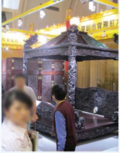
Image 6: Rosewood furniture at a trade show in Shanghai. The bed displayed above retails for approximately USD800,000

Traditionally, "red wood" referred to some 33 species from Southern China, India, Burma, Vietnam and other Southeast Asian countries. The most sought-after species are Red Sanders (Pterocarpus santalinus) and Hainan Scented Sanders (Dalbergia odorifera), but rosewood from Madagascar has become a good substitute for these increasingly scarce Asian species. Due to the difficulties in obtaining rosewood from Madagascar, its ever-increasing retail price, and the fact that similar species are more easily accessed from other East African countries, many of the factories have recently ceased to use rosewood. EIA estimates that more than 50 per cent of the "red wood" factories do not use Malagasy rosewood as their main material due to its high price, but rather keep a small inventory of both raw wood and furniture. Officials at several factories located around Beijing area said that they did not keep a good inventory of rosewood,