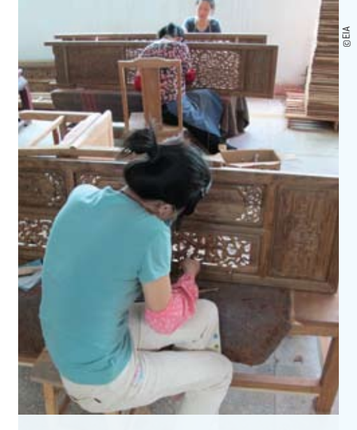
Image 5: Traditional carving at a furniture factory in Shenzhen. Factories such as these turn raw logs from Madagscar into valuable luxury items.

earn up to USD100,000 per year, while more junior employees might earn USD10,000.