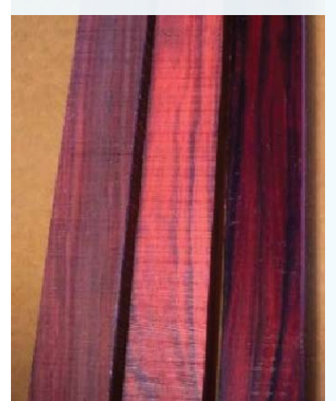
Image 8: Malagasy "bois de rose" offered for sale by a US distributor of semi-finished wood products. The distributor warns that the wood is no longer easily available

Images 9,10: Rosewood samples in the Timber Shop of Theodor Nagel, Hamburg (origin not indicated)