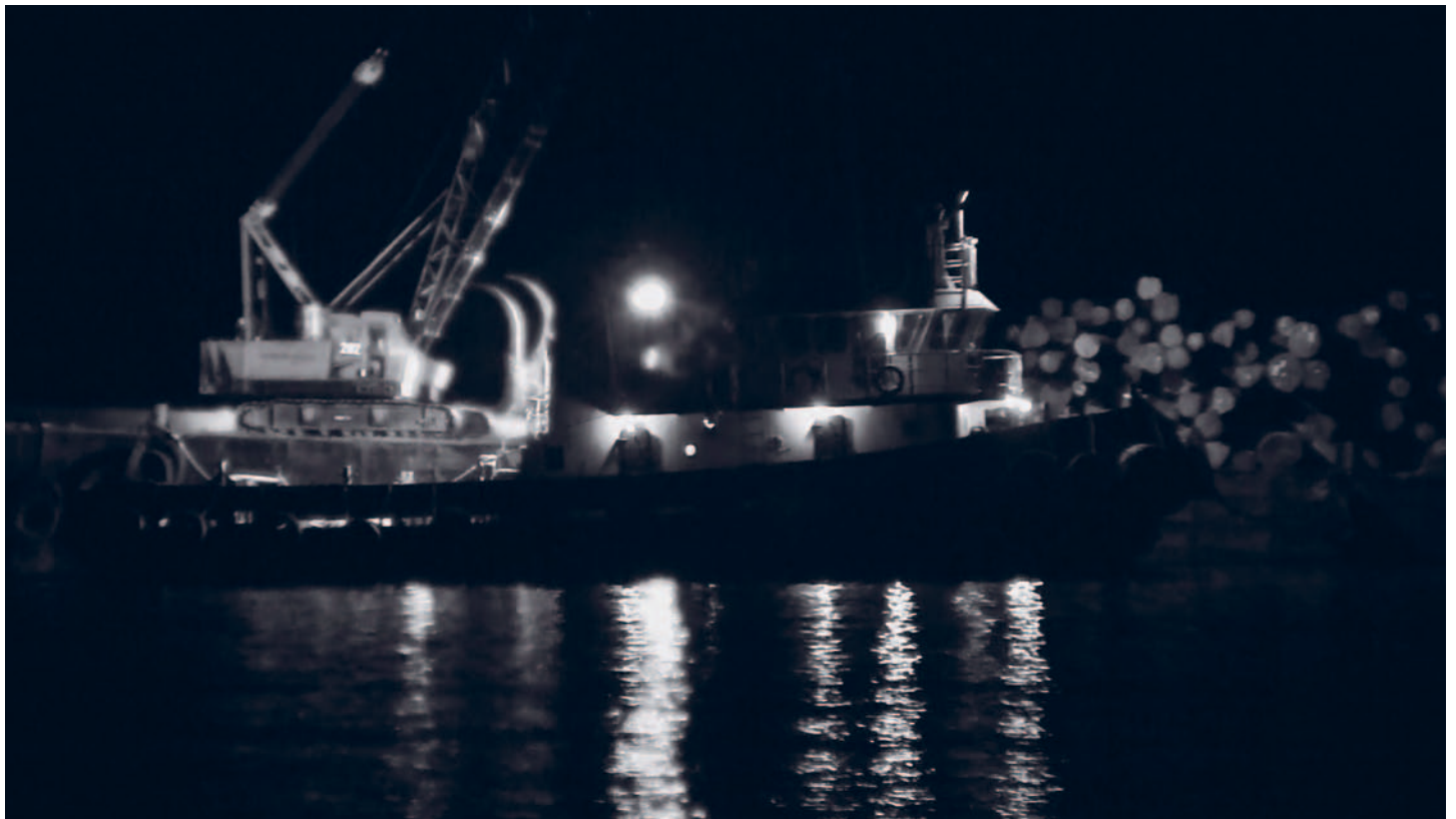
Logs from an SABL in East Sepik province being loaded onto a barge at night on 19 August 2014. The government published a summons for the return of the SABL title on 11 July 2014 "for the purpose of cancellation/deregistration". The SABL was declared "null and void" and any logging in the SABL area illegal in a separate decision by the National Court on 4 July 2014, a decision that is under appeal.

In April 2014, the National Forest Board issued a new clearance permit over a contested SABL area covering 105,200 ha of mostly intact rainforest in West Sepik province. 9 The COI recommended that this SABL be surrendered and renegotiated on the basis of ongoing disputes between landowner groups and serious irregularities in the issuance of certain approvals. The NEC declared a moratorium on the issuance of new clearance permits in 2011, although this decision was challenged in court and apparently struck down in a 2013 ruling. 10 In June 2014, the NEC reaffirmed a moratorium, instructing the PNG Forest Authority "to continue to observe the NEC Decision and not issue any more Forest Clearance Authority to SABLs". 11