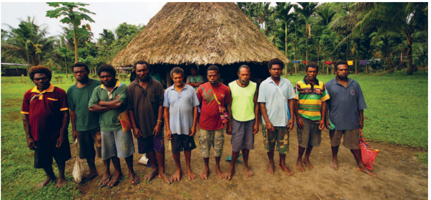
Community leaders and landowner company chairmen from Mauna Village in the Pomio district of East New Britain, who say their land was included in an SABL without their consent.

In October 2014, the National Forest Board renewed the clearance permit for 42,000 ha covering three SABLs in the Pomio District of East New Britain, despite being aware of widespread opposition from local landowners whose land was included in the permit area. In September 2014, the elected ward councillors and other community representatives from the villages of Bairaman, Mauna and Lau, located within the SABL area, wrote to the National Forest Board requesting that a forest clearance permit issued in 2010 over their land not be renewed. Some landowners are alleging that the SABLs in their area were obtained by fraud and forgery and are currently pursuing civil litigation. In October, the Board renewed the permit for six more years. Rimbunan Hijau recently stated that its subsidiary has already cleared 7000 hectares of rainforest in the area to make way for palm oil plantations. 14 The project will account for an estimated 40% of log exports from SABLs and at least 12% of PNG’s total log exports in 2014. 15 By April 2014, the company had exported over 500,000 m 3 of timber, mostly to China, with a declared export value of over US$50 million. Global Witness is not alleging that there is evidence implicating Rimbunan Hijau or its subsidiaries in fraudulent activity. 16