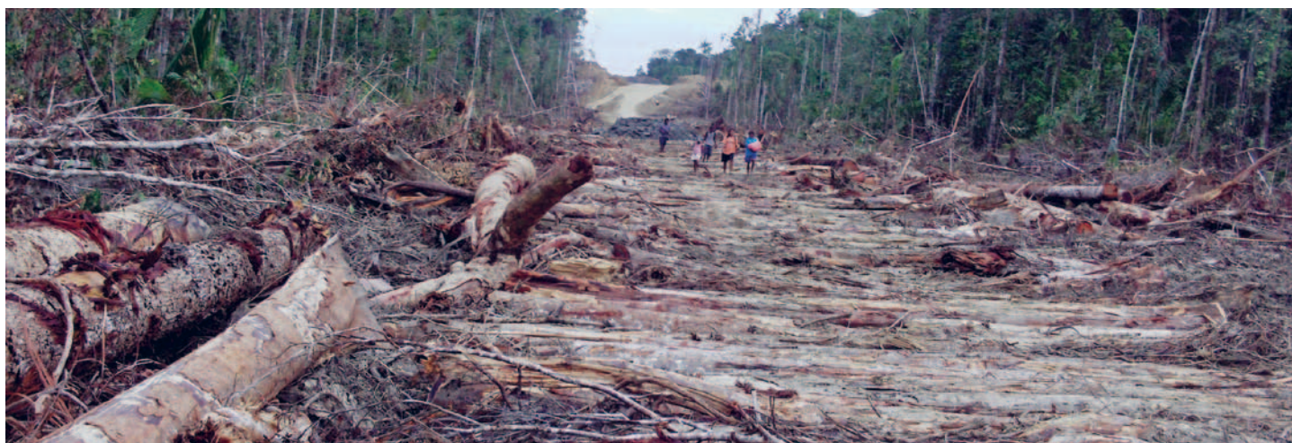
Logging road in a major timber exporting SABL in West Sepik province.