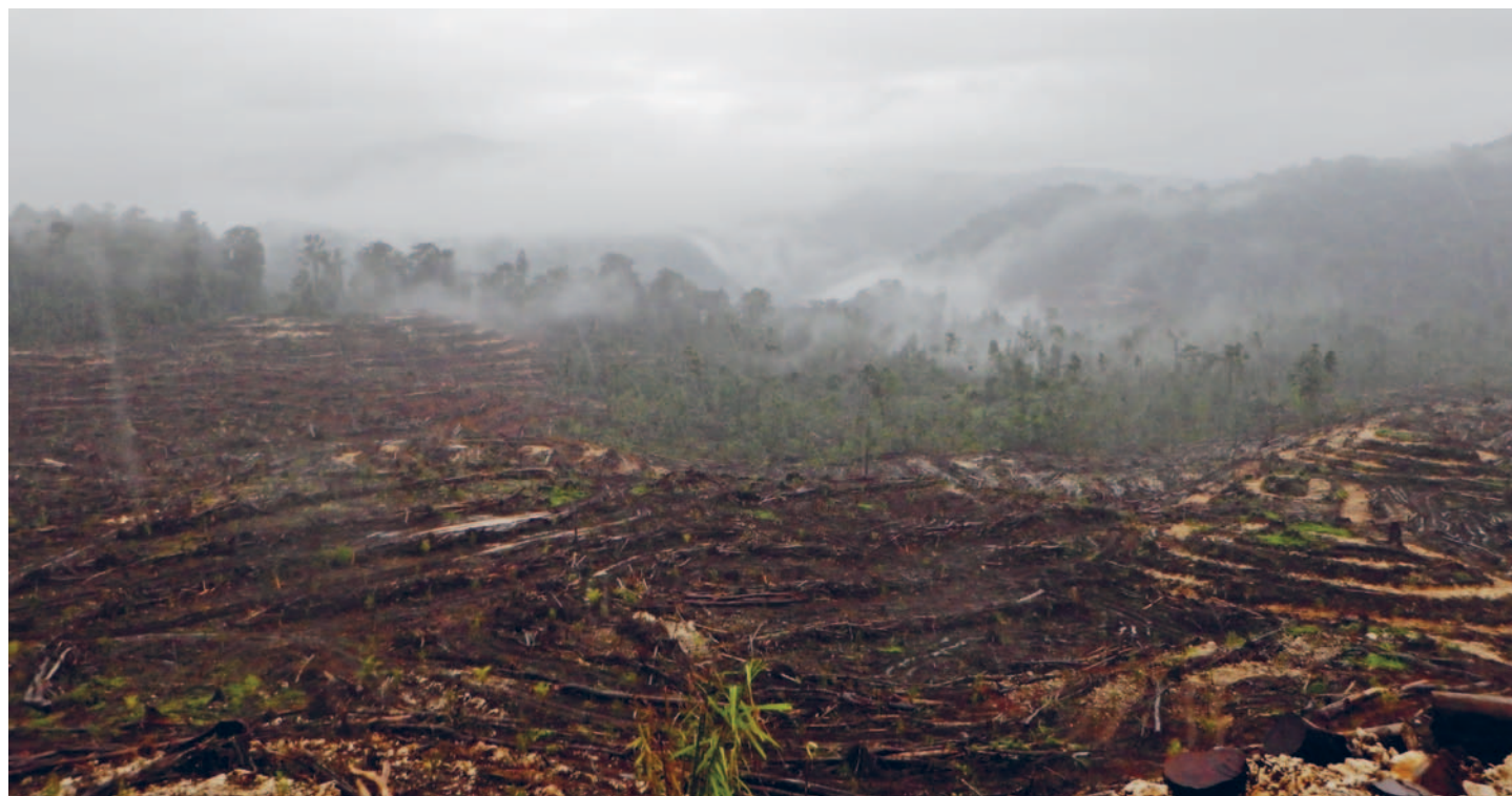
Recent clearance of intact rainforest for oil palm plantations under an SABL in the Pomio district of East New Britain province in August 2014.