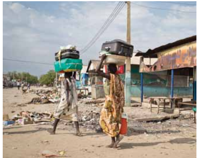
Women carry their belongings as they head for shelter in the United Nations Mission in South Sudan (UNMISS) base in Malakal, Upper Nile state, January 2014.

The Mittal deal in post-conflict Liberia is an example of an extractive industry contract signed without a robust governance framework in place, which failed to secure favourable terms for the government. The 2003 Accra Peace Agreement installed the National Transitional Government of Liberia, bringing together former warring factions.