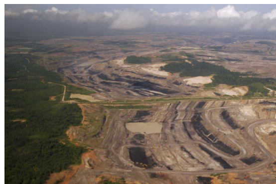
An aerial view of Adaro's Tutupan coal mine in Indonesia's South Kalimantan province

At the same time as expanding its offshore network, Adaro stands to benefit from Indonesian government financial guarantees for the US$4 billion Batang coal-fired power plant, which will be the biggest in Indonesia, in which Adaro is a joint venture partner. Adaro expects the power plant to create up to US$80 million a month in revenues for the joint venture, of which Adaro itself owns 34 per cent, once it is up and running. This means that, in effect, Adaro is relying on the government (and therefore Indonesian citizens) to provide a guarantee for one of its sources of future profit while, at the same time, making use of offshore companies which may reduce its potential tax payments in Indonesia.