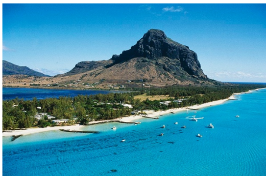
Mauritius, the Indian Ocean island where Adaro Energy has two subsidiaries in its offshore network

accounts and not all of Arindo Holdings' accounts are available online (companies are not required to publish any or all of their accounts in Mauritius). Neither company appears to have paid tax in Mauritius until at least September 2017, after which Arindo changed the status it held under local corporate law, in order to raise capital and become listed on the stock exchange of Mauritius, and it appears will now be subject to a maximum tax rate of 3 per cent. 22