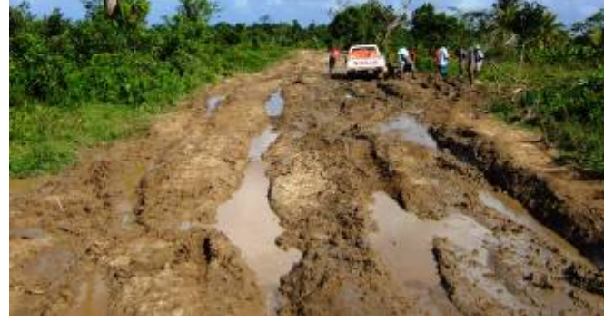
Photo 9: Road between Antjahamarina and Ambalabe Photo 10: Taxi brousse carrying rosewood