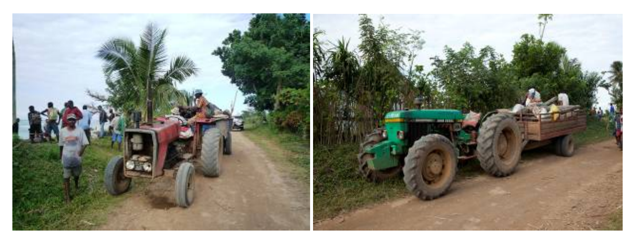
Photos 13, 14: Tractors transporting rosewood to Mahatsara, Antalaha

None of the authorisations to transport wood required by law (Article 40, Decree 98-782) could be produced by the drivers of the observed vehicles.