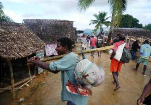
Photos 17, 18 "Casinos" and forest workers in the village of Antanandavaheli

Antanandavaheli has subsequently seen an influx of more than 800 people. A number of itinerant merchants have settled temporarily in the village; small temporary restaurants are run by businesspeople from Antalaha, and at least three "casinos" are frequented by the village youth from morning to late evening. At the onset of logging activities, an understanding of the risk of sexually transmitted diseases through the introduction of prostitution inspired the local HIV/AIDS association to carry out an awareness raising campaign.