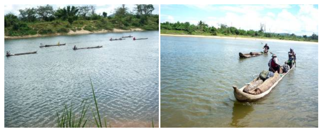
Photos 15, 16: Boats transporting rosewood from Masoala NP to Antjahamarina

The team hired two boats to reach the area of logging activities in the Masoala National Park, in order to observe the transport of rosewood, evidence of which had been found at the locations mentioned above. On the five-hour journey upriver, 42 boats were counted, each carrying an average of five logs of varying sizes.