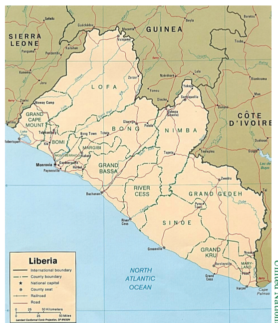
Map of Liberia

Matters came to a head when Taylor – under international pressure to quit, and with Monrovia surrounded by rebels