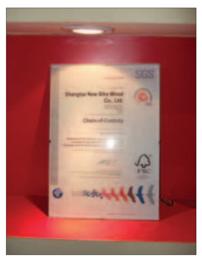
Shanghai New Sihe Wood Co., Ltd., FSC CoC certificate; September 2006