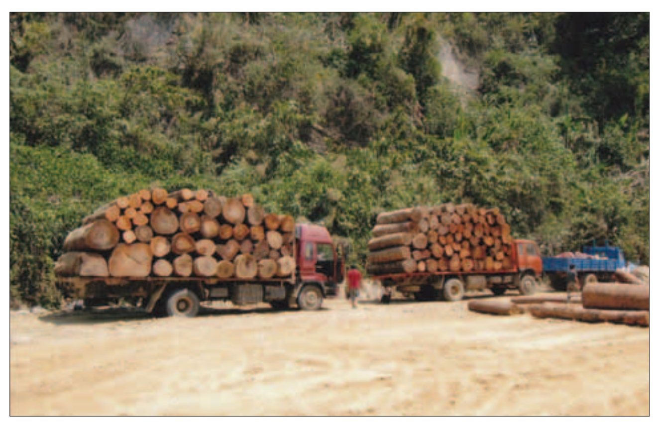
Reloading logs from Gwi Htu on the Zuklang Road, Burma; April 2009