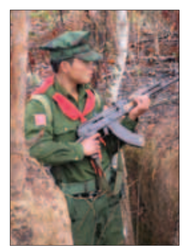
KIA soldier; June 2005

Witness has been unable to verify these reports. The SPDC subsequently reported that voter turnout was 98% and that 92% voted yes.