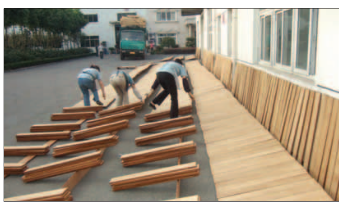
Zhejiang Fangyuan Wood Co., Ltd., drying teak flooring; September 2006

As for certificates for legality or sustainability, the representative explained that the company can provide a country of origin document from the Chinese government authorities stating 'Made in China' but not from where the timber was logged. Apparently, the company could also provide FSC certificates for the teak and the padauk flooring. According to the sales manager, the company had obtained FSC certificates for 40,000 m<sup>2</sup> flooring each year. Certificates could be provided for all products in the product range produced by the company but they are, "only for our long-term and old customers as we have a limited amount".212 New Sihe Wood has FSC CoC certification (Certificate Code: SGS-COC-2406). FSC CoC traces FSC certified timber through the production chain. However, no timber from Burma has ever been certified by the FSC and is not therefore covered by the certificate, contrary to what we were told by the manager who still works at the company.