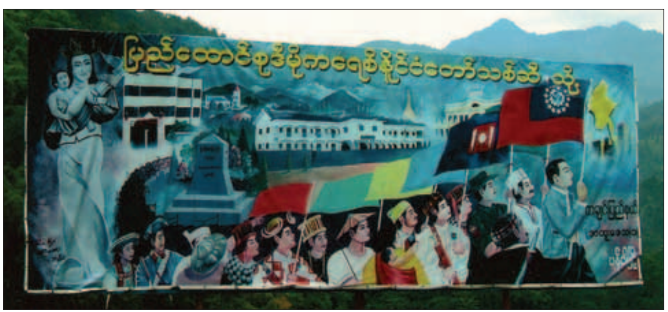
"Towards a Democratic Nation", NDA(K) poster in Pangwah