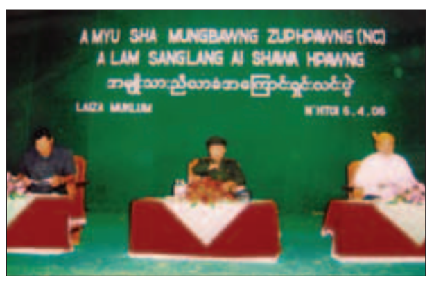
"The National Convention Explained", Laiza; April 2006

The referendum took place, as planned, on 10 May 2008 in most parts of the country and on 24 May 2008 in the cyclone Nargisf7- affected areas, including Rangoon. According to the Kachin News Group, 62% voted in favour of the constitution in Myitkyina, Waingmaw, Bhamo and Laiza, all KIO-controlled areas.<sup>234</sup> Prior to the referendum the SPDC had conducted a tightly managed campaign for a 'yes' vote and very little public debate took place because it was illegal to criticise the constitution. Numerous voting irregularities were also reported<sup>235</sup> including the deletion of almost 100,000 names from the original draft list of voters in Myitkyina,<sup>236</sup> apparently without explanation, and fining the residents of certain villages in Shan State 100,000 kyat (US$90) for voting "no" in a mock referendum held earlier in April.<sup>237</sup> Global