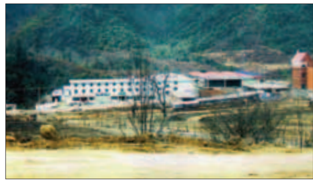
New Pangwah Town; January 2007

Despite their historic differences, the KIO and the NDA(K) always seem to have worked out mutually beneficial logging and timber transportation sharing arrangements. This enables timber cut in the KIOcontrolled area of the Triangle to reach the China border through NDA(K) held areas.