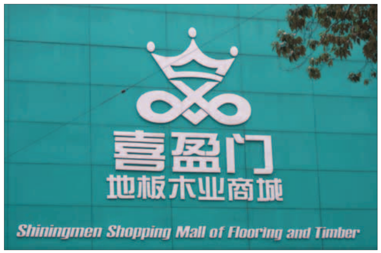
The Shiningmen Shopping Mall of Flooring and Timber; September 2006

King of Teak has its own factory inside Burma, near Ruili. One member of staff produced a stamped customs document, from Ruili customs, dated 6 April 2002 allowing the importation of 225,000 kg of timber. "The fact that the border is closed does not affect us too much because we have our own factory inside Burma. We have not put up the price as much as the others have done. Maybe 20% higher than before. We go through the official channel with certificates - over land. [...] Our factory is the only factory in Burma that has been authorised by the authorities."219 A factory located in Yunnan Province manufactures the finished products out of the imported raw materials.<sup>219</sup>