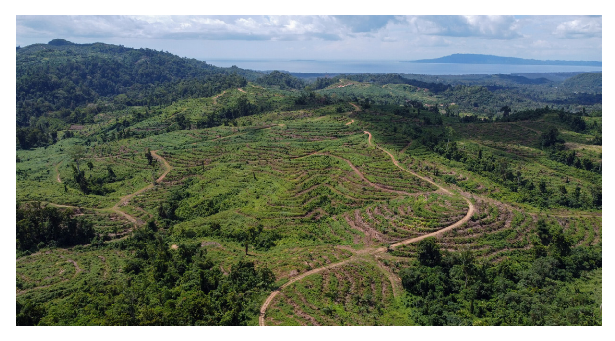
Land has been cleared for Oil Palm plantations in the Bainings region of East New Britain, Papua New Guinea.