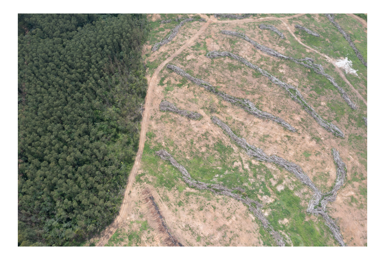
Photo credit. Deforestation of the Amazon rainforest in Pará State, Brazil © Global Witness.

The evidence gathered is a clear testament to how voluntary guidelines and individual commitments by many financial institutions are unlikely to halt the continued funnelling of financing to harmful activities that destroy the world's forests and makes the case for the European Commission to introduce robust obligations to prevent banks and investors from continuing to bankroll deforestation9.