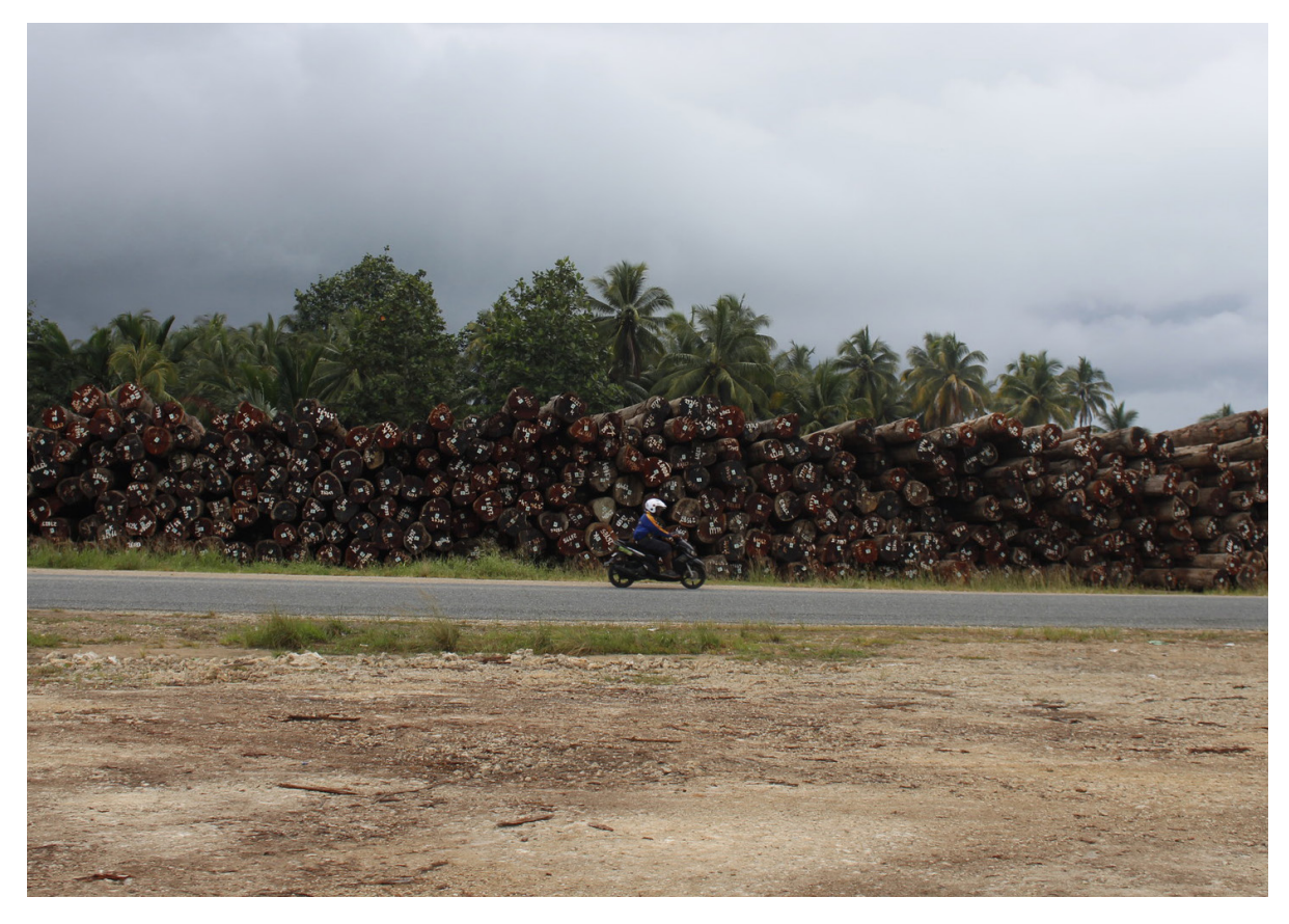
Bewani SABL, West Sepik Province, PNG