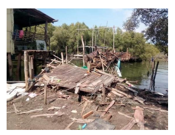
Community members in Taliptip demolish their own homes in exchange for financial compensation from San Miguel.

"What they took is greater than the return"