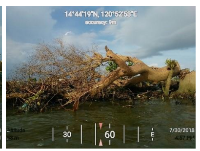
Geotagged photos conducted on a spot visit by local government officials in Bulacan show the destruction of mangrove trees in San Miguel's airport development area in 2018.

San Miguel's first impact assessment points to just two mangrove habitats within the project site. <sup>107</sup> This includes the Bulakan Mangrove Eco-park, reportedly managed by the Philippines government. Four major mangrove clusters across the airport project area were later identified in the company's second impact assessment which also indicates that San Miguel had obtained a permit from the local government to cut trees. <sup>108</sup> An inventory recorded a total of 4,647 trees – 98% of which were mangrove tree species, over half within the boundaries of the airport project. <sup>109</sup> Almost half of Bulacan's mangroves will be destroyed because of the airport, according to according to a forest mapping study conducted by the University of the Philippines. <sup>110</sup>