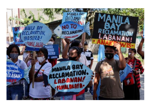
Local fisherfolk protest against reclamation projects across Manila Bay, including San Miguel's airport development.

also told Global Witness that its due diligence process included a review of Boskalis' plans to manage the project according to international standards including the Organisation for Economic Cooperation and Development (OECD) guidelines.<sup>56</sup>