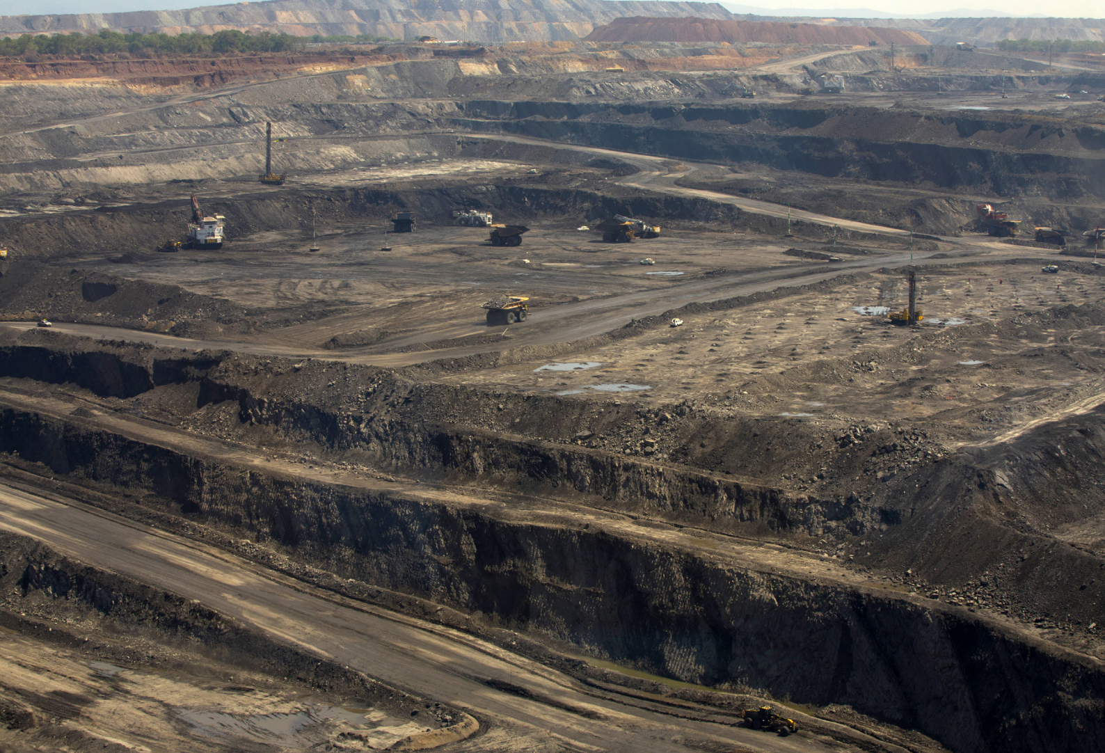
Machinery operating in the annex pit at the Cerrejon Coal Mine in Barrancas, La Guajira, Colombia.