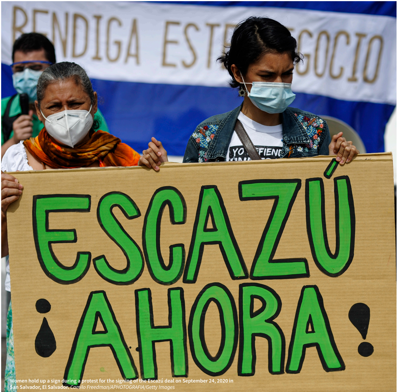
Women hold up a sign during a protest for the signing of the Escazú deal on September 24, 2020 in San Salvador, El Salvador.

In a promising development, on the 5th November Mexico became the 11th country to ratify the landmark Escazú Agreement for Latin America and the Caribbean – meaning it has now come into effect. The regional treaty sets out commitments for public participation in environmental management and standards for access to information and decision-making on environmental matters. Crucially, for the worst affected region it establishes legally binding commitments for protecting environmental defenders – the first time this has been included in an agreement of this kind.