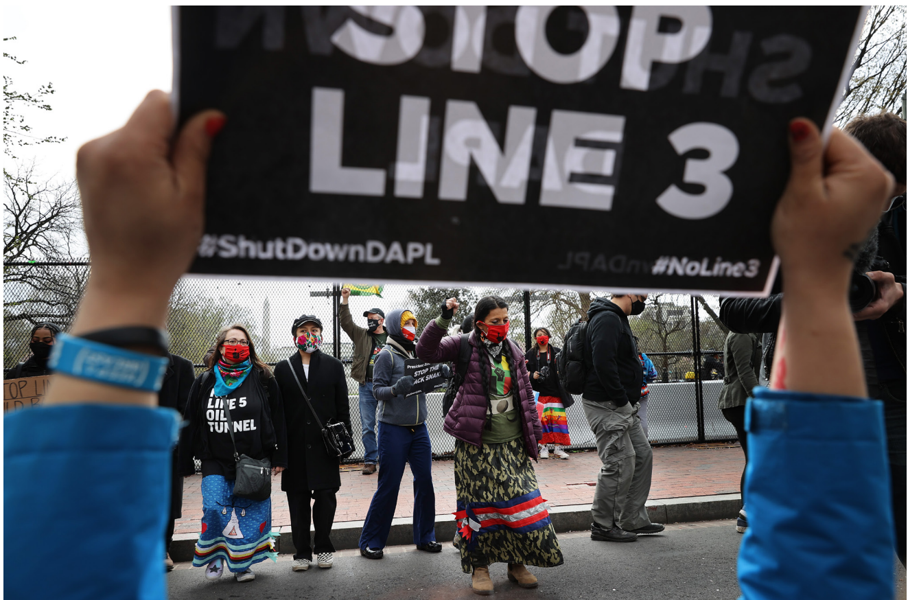
Indigenous environmental activists dance in a circle outside the White House to protest against oil pipelines. Organized by the Indigenous Environmental Network, the demonstrators called on President Joe Biden to ‘Build Back Fossil Free’ by stopping the Dakota Access and Line 3 pipelines.