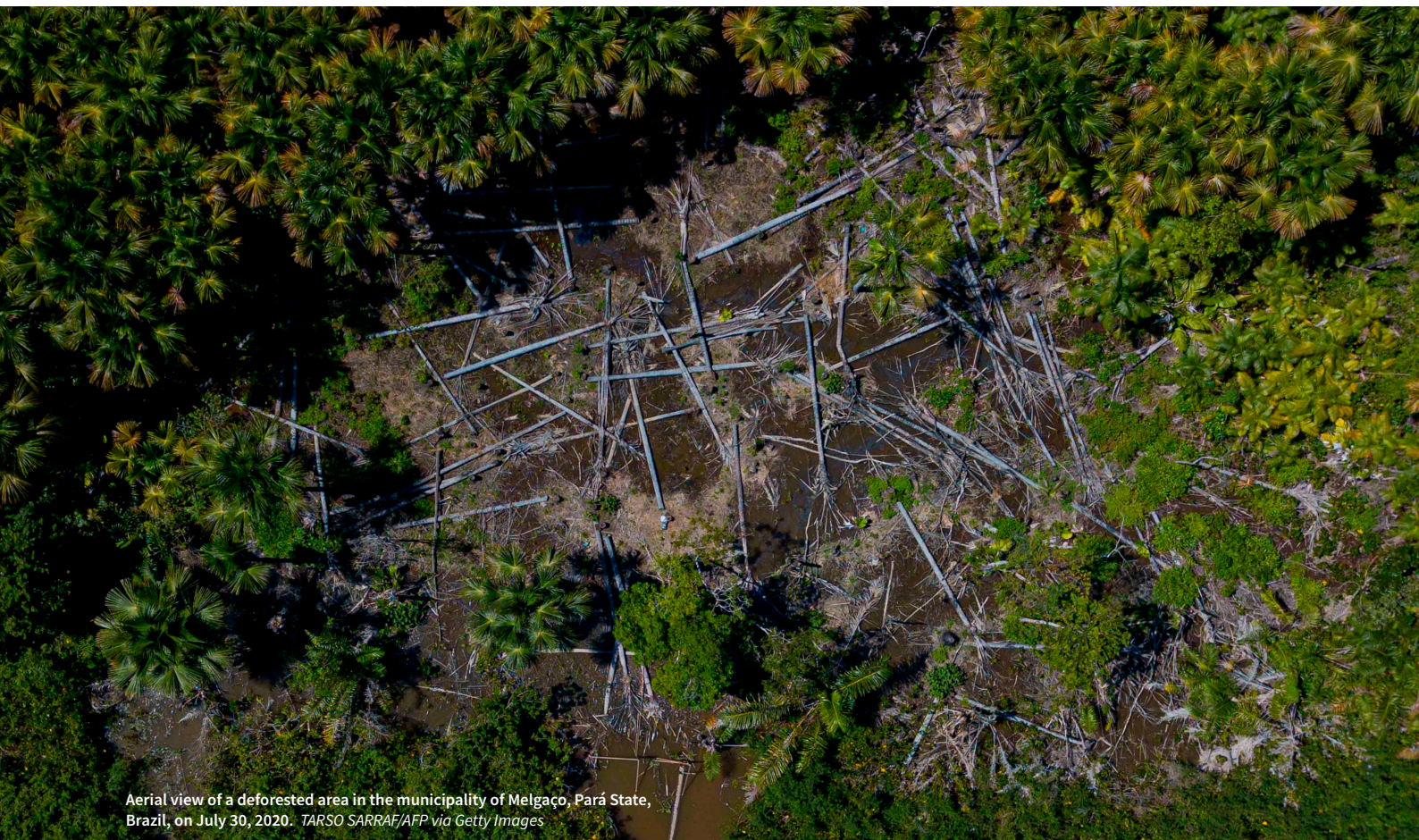
Aerial view of a deforested area in the municipality of Melgaço, Pará State, Brazil, on July 30, 2020.

* We define land and environmental defenders as people who take a stand and peaceful action against the unjust, discriminatory, corrupt or damaging exploitation of natural resources or the environment. For more detail, see our methodology on page 27.