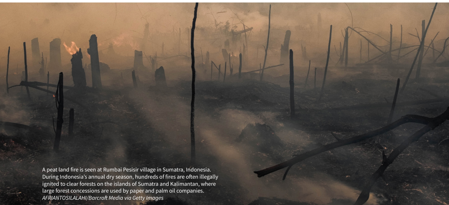
A peat land fire is seen at Rumbai Pesisir village in Sumatra, Indonesia. During Indonesia's annual dry season, hundreds of fires are often illegally ignited to clear forests on the islands of Sumatra and Kalimantan, where large forest concessions are used by paper and palm oil companies.